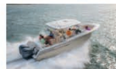
Freedom 307 (2015-)