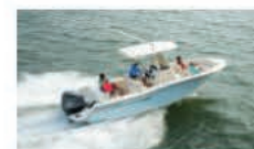
Fisherman 236 (2016-)