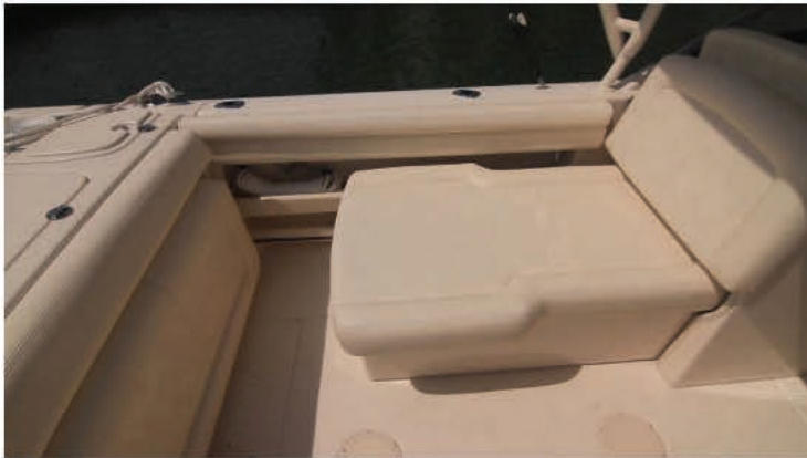
The cockpit comes standard with an electro-mechanically extendable, aft facing lounge seat that mates with the transom seat back aft. Stereo remote controls are under the port gunwale. Plenty of rod holders, rod storage racks and cup holders are provided.