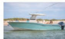
Canyon 271 FS (2016-) Freedom 275 (2016-)