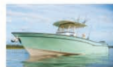
Canyon 306 (2017-)