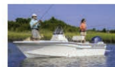
Fisherman 180 (2015-)