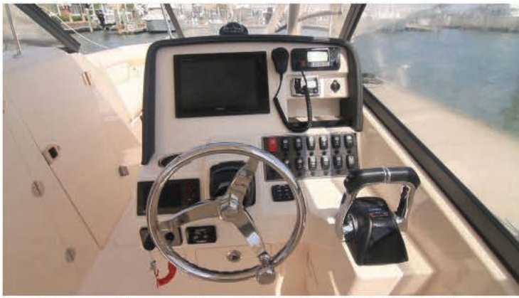
The helm supplies enough room for a single 15" display. The steering wheel and engine controls are comfortably situated.