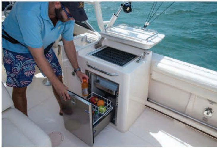
The wet bar can be equipped with a drawer-style electric refrigerator in lieu of the cabinet drawers.