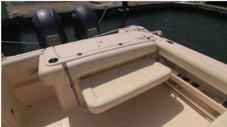
The transom seat folds up and down with little effort, built-in handholds are created by the end supports, and the seat itself is thickly cushioned and contoured for comfort and support. A big insulated fish or storage box (seen open here) and livewell to port, with a full-column distribution system for long bait life, is provided.