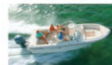
Freedom 225 (2015-)