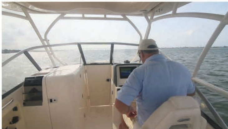
When the center window and door are closed, and plastic curtains installed, the boat can be used in inclement weather, or early and late in the season.

is supported by a hull color-matched, painted aluminum frame and is complemented by the boat's large wrap-around glass windshield. Grady-White paints rather than powder-coats its aluminum, finding that this automotive-based process is both more durable and easily repaired. The tall windshield provides excellent all-weather visibility, and combined with the plastic side curtains and hardtop (which can support outriggers and electronics), adds three-season use for the owner.