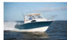
Marlin 300 (2017-)