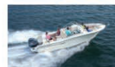
Freedom 235 (2016-)