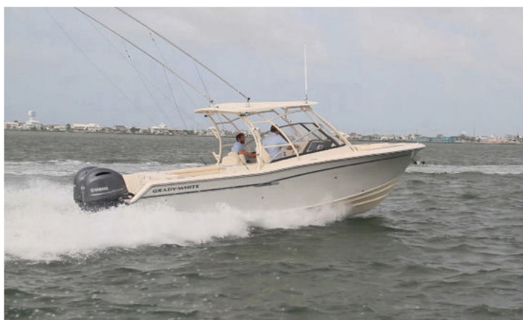
The boat's bottom shape, strakes and chine flats, with an assist from the Carolina flared bow, keeps occupants comfortable and dry at speed in rough water.

capable cousin to the sterndrive powered bowrider. The hulls for all nine Freedom DC models from 19' to 37' (6 m to 11 m) come out of the same molds as their center console stable mates. The intent is to provide anglers with a proven fishing platform – the aft half of the DC and CC models are similar if not identical – while at the same time offering family entertainment, cruising and watersports capabilities. The boat's C. Raymond Hunt-designed deep-V bottom and twin-engine power allows her to cruise comfortably in conditions that bowriders, and many other dual consoles for that matter, are incapable of handling. The Grady-White Freedom 275's rough-water capability allows her to be used more reliably on a given outing that's been long planned, and also allows the boat to be used more days each season, increasing her value relative to many sportboat dual consoles.