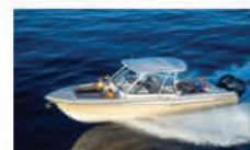
Freedom 285 (2016-)