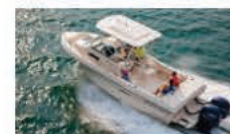
Gulfstream 232 (2015-)