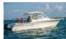
Express 330 (2015-)