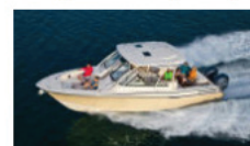
Freedom 335 (2015-)