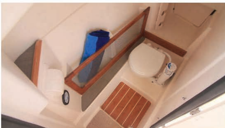
Real teak accents for the head's sole and vanity add a touch of class to the Freedom 275. Headroom down below is generous for a 27 footer, and the door opens to permit entering the head from an angle, which is more comfortable for the larger or taller people.

The port side console houses the head compartment, which features a heavy-duty lockable door, a marine head with macerator unit (with 10-gallon holding tank), vanity mirror and three rod holders. A toilet upgrade to an electric flush marine head with macerator and 10 gallon (38 L) holding tank is available. The builder offers customers two entertainment console options. An optional deluxe wet bar is located directly behind the helm seat and includes a Corian countertop, drink holders, a fire extinguisher holder, sink, storage drawers and a trash compartment. The console can be upgraded with an electric inverter powering a 1300W grill that replaces the shallow storage tray.