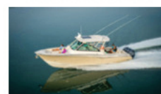
Freedom 375 (2015-)