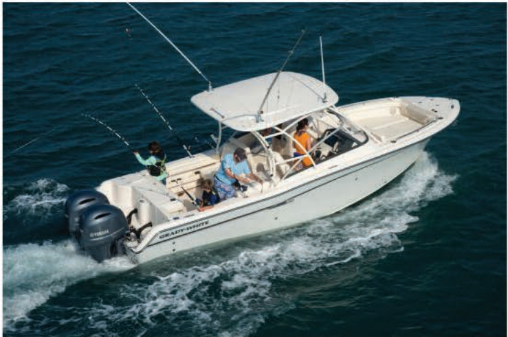
A bird's eye-view of the Freedom 275's fishing cockpit.

Grady-White equips its Freedom 275 with four different outboard propulsion options from Yamaha. Standard equipment is a pair of Yamaha 150-hp 4-stroke engines, while twin F200 4-cylinder and F250 6-cylinder outboards are also available. A single F350 is also offered and Yamaha’s Helm Master joystick control is available with the F250s, adding an all-digital helm, joystick control capability and integrated autopilot.