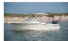
Freedom 255 (2015-)

Grady-White is known for producing rugged offshore and coastal fishing rigs, but its Freedom line of dual consoles targets the whole family's needs for boating. The Freedom 275 is a dual console, outboard-powered, self-bailing, big-water-