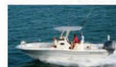
251 CE (2015-)