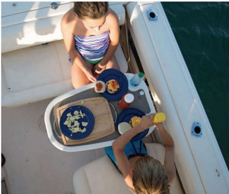
The removable bow table can also be used in the cockpit, as is shown here.