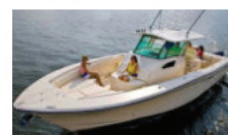
Canyon 366 (2011-)