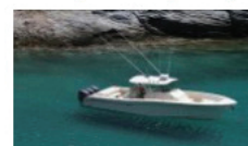
Canyon 376 (2016- )