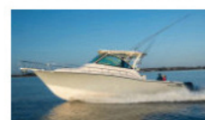
Express 370 (2017-)