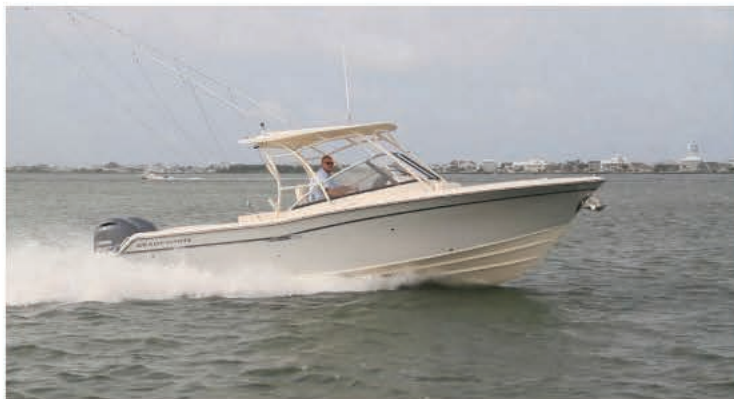
The Grady-White Freedom 275 has a length of 26'11" (8.20 m), a beam of 8'6", and a draft of 20" (0.51 m).