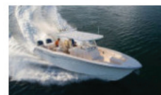
Canyon 336 (2015-)

The bow seating area is both convertible to suit the occasion and generously proportioned. Two lounges with backrests and long handholds provide comfort and safety. Also keep in mind that the hull's ultra-smooth ride makes things safer and more comfortable up in the bow where motions are most pronounced. A table inserts into a deck socket when wanted during lunch or cocktails, and a filler section on centerline converts the bow into a big sun pad or, with cushions removed, a big casting platform. The crew can walk right up to the anchor locker to handle the anchor and docklines without having to kneel on the seat, which is a detail we like.