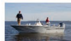
191 CE (2015-)