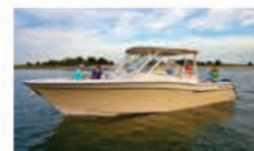
Freedom 335 (2013-)