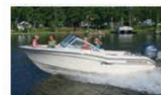
Freedom 192 (2015-)