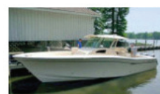
Canyon 366 (2009-)