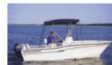
180 Fisherman (2011-)