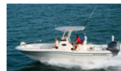
251 CE (2015-)