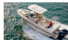
Gulfstream 232 (2015-)