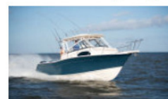
Marlin 300 (2017-) Canyon 326 (2019-)