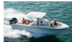
Freedom 275 (2016-)