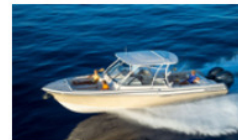
Freedom 285 (2016-)