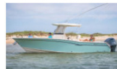
Canyon 271 FS (2016-)