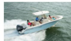
Fisherman 236 (2016-)