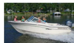
Freedom 192 (2015-)