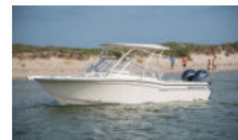
Freedom 255 (2015-)