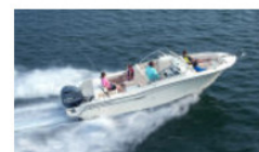
Freedom 235 (2016-)