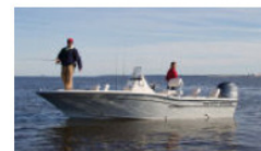
191 CE (2015-)