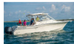
Express 330 (2015-)