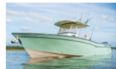
Canyon 306 (2017-)