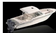
Freedom 325 (2018-)