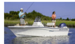
Fisherman 180 (2015-)