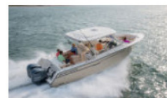
Freedom 307 (2015-)