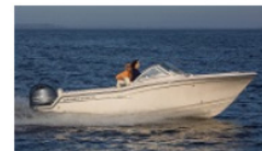
Freedom 215 (2018-)