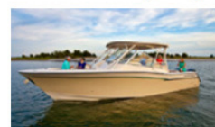
Freedom 335 (2013-)