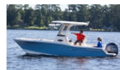
Fisherman 216 (2018-)