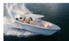
Canyon 336 (2015-)