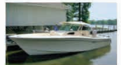
Canyon 366 (2009-)