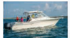
Express 330 (2015-)