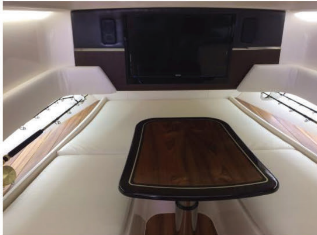
With nearby rod storage for those who eat and sleep fishing, the dining table serves double-duty as a sleeping platform with the addition of a fill-in cushion. The dinette seats four for dinner or cocktails and sleeps two. It is electrically actuated. A TV is on the forward bulkhead.