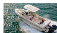
Gulfstream 232 (2015-)