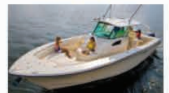
Canyon 366 (2011-)