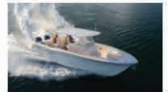
Canyon 336 (2015-)