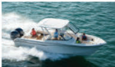
Freedom 275 (2016-)