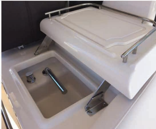
To port, forward of the seats is a sink under a swing-up counter that has many uses. The faucet wand raises and lowers and pulls out and can be used to wash off the removable cutting board above.

We were impressed by the thought and engineering that has gone into the Canyon 456's cockpit. The 14' (4.27 m) beam allows the integration of the Sea Command Center's aft-facing fishing station, with dedicated air conditioning/heating vents and seating for three in high, dry, and exceedingly comfortable seats. The middle seat has a flip-up bolster that serves as a leaning bar. Tackle storage has room for six Plano boxes plus two additional gear drawers that slide from under the bolstered seating.