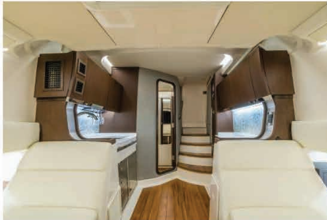
Looking aft we see the companionway stairs and entry to the head to starboard.