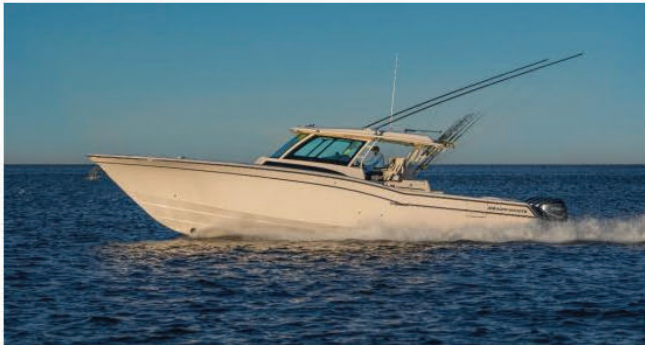
The new Grady-White Canyon 456 made her debut at the Miami boat show last month. We think she is the best boat that Grady has ever built.

The Grady-White Canyon 456 was created for those looking for the top-of-the-line alternative to traditional sportfishing convertibles which cost several million dollars, usually require a paid captain, and have annual maintenance costs that can easily go into six digits. It is also positioned for anglers wanting to move up to a sportfishing machine that is also a large, comfortable yacht, but still be easily handled. In the process, virtually every creature comfort that Grady's engineers could imagine was baked into the boat.