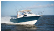
Marlin 300 (2017-)