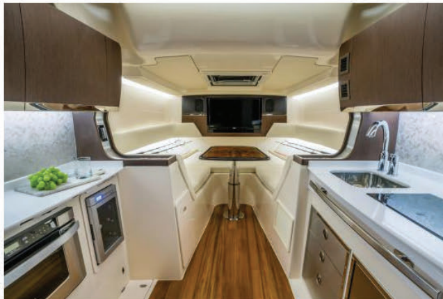
The cabin on the Canyon 456 is an oasis of tranquility and a refuge from the heat or rain topside. Note the cabinets above the counters, the microwave, and wine cooler to the left and the refrigerator drawers to the right.

The Galley. Below the portside countertop is a full-size microwave drawer, and a six-bottle wine cooler. A stainless steel sink and cooktop are located amidships on the starboard counter, with a refrigerator below. Lighted glass shelves are above the counters on each side.