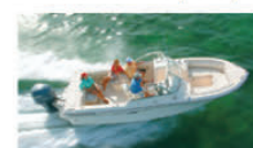
Freedom 225 (2015-)