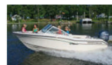
Freedom 192 (2015-)