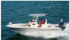
251 CE (2015-)