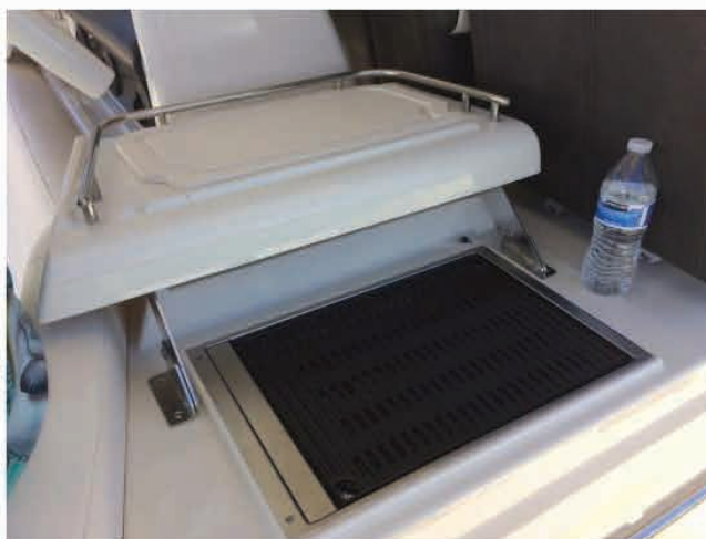
To starboard, between the helm and cockpit seats, is an electric grill beneath another flip-up counter.