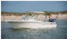
Freedom 255 (2015-)