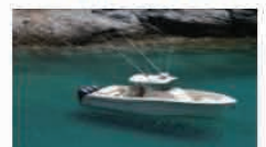
Canyon 376 (2016-)