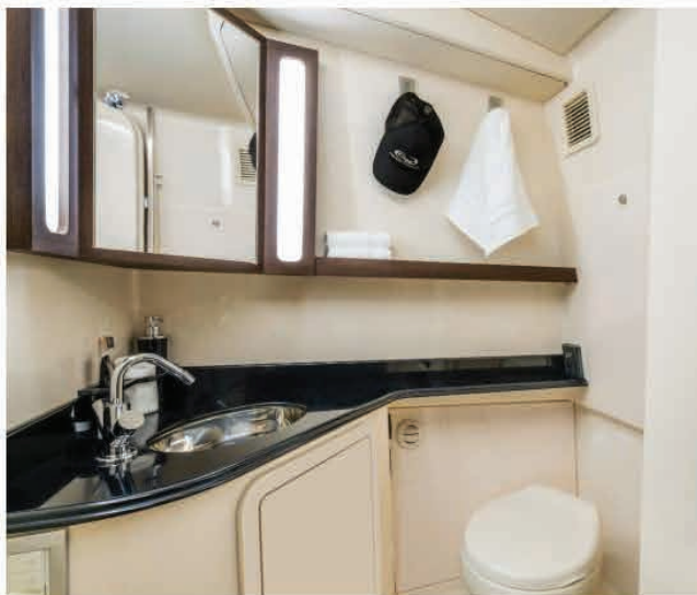
The head has full standing headroom and is remarkably large, thanks to the boat's 14' (4.27 m) beam. There is a separate shower stall. The toilet is a VacuFlush and there is a 20 gallon (76 L) holding tank.