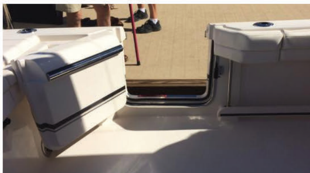
Side doors on each side of this boat make getting on and off at a dock easy. They are also ideal for hauling aboard fish, swimmers, or scuba divers.

Transom Fishbox. In the center of the transom is a 459 quart insulated refrigerator/freezer fishbox – with lights – that is digitally controlled. Of course, it drains overboard. There are two partitions so that it can be made into three separate compartments to adjust for the catch of the day.