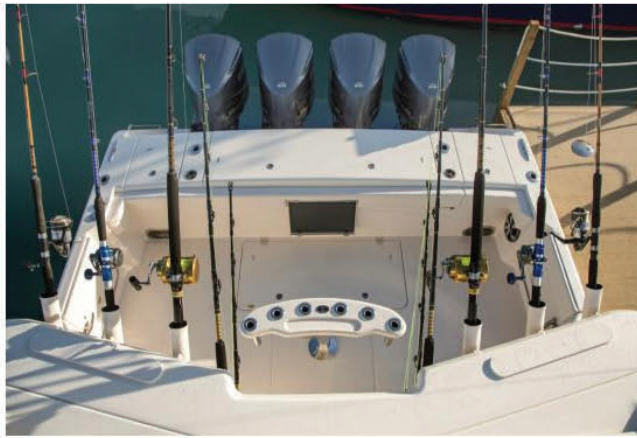
The Canyon 456 is powered by four Yamaha 350-hp engines. Livewells are in the transom both port and starboard, and are 35 gallons (1,321 L) each, with lights and full column distribution inlets, overboard drains and 1500 GPH (5,678 L) pumps. The black rectangle in the transom is a covered 24" screen to show the anglers sonar and navigation data.