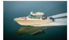
Freedom 375 (2015-)