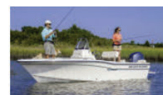
Fisherman 180 (2015-)