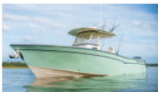
Canyon 306 (2017-)