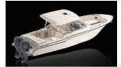
Freedom 325 (2018-)