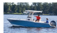
Fisherman 216 (2018-)