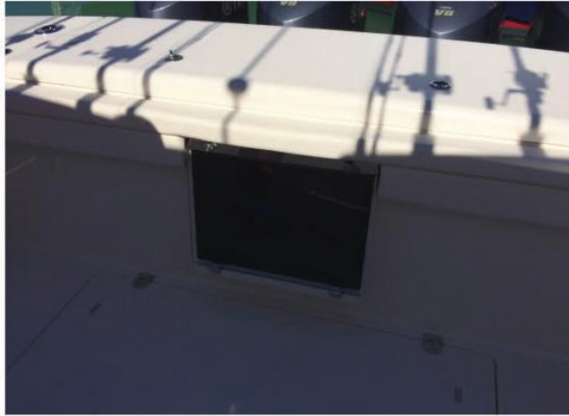
While this is not a good photo due to the setting sun, what is shown is a 24" protected screen that can display the fishfinder data or navigational details. (Dealer installed option)

Mini-Galley on Deck. Portside there is a sink with an adjustable pull-out faucet hose with spray nozzle. The starboard side has a refrigerator and grill, and both have swing-up cutting board for bait prep or dressing freshly caught fish. When in the down position, these cutting boards become a handy place for beverages or snacks, and the rails around them keep everything in place.