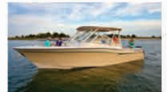
Freedom 335 (2013-)