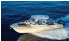
Freedom 285 (2016-)