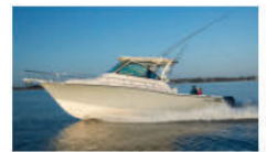
Express 370 (2017-)

With the addition of the optional canvas and Clear2Sea side curtains, the helm can be buttoned up for three season boating. This option creates a tremendous amount of added utility for this yacht, which can really do anything and go most anywhere adventuresome boaters would like.