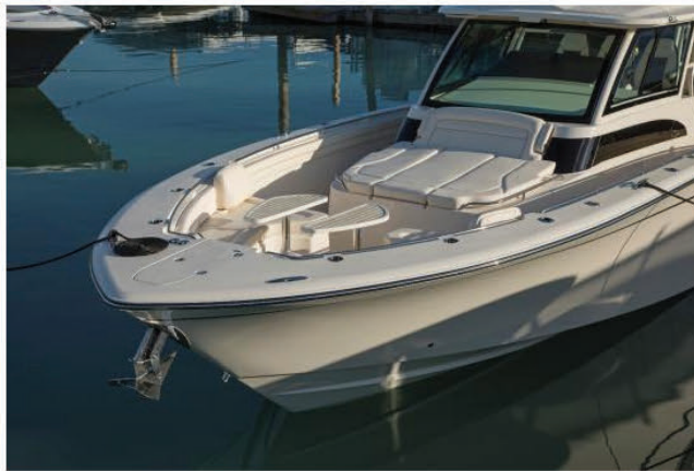
On the trunk cabin there is a built-in sun pad with deluxe chaise seating fold-down armrests. Note the rail around the cushions.

Dining and Sunning. Atop the storage boxes, deeply cushioned seating complemented by three-way positioned stowable backrests surrounds two motorized semi-circular fiberglass tables. When the tables are in the down position, they can be covered with cushions for yet another lounging platform. One notable advantage of the semicircular tables is that they allow access all the way to the bow and windlass, and loungers need not move out of the way.