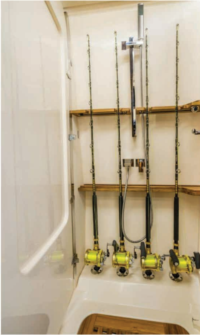
Even the shower stall can perform double-duty as rod storage. The teak grate is standard.