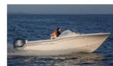
Freedom 215 (2017-)