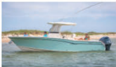
Canyon 271 FS (2016-)