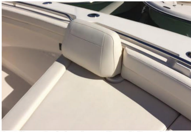
A rotating seat back allows the seats forward to be used chaise-style with guests facing forward. Note the fine upholstery job. Remember, this is a center console extraordinaire.