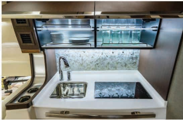
The galley has a two-burner glass stovetop and sink with refrigerator below. We like the cupholders next to the galley.