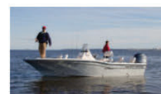
191 CE (2015-)