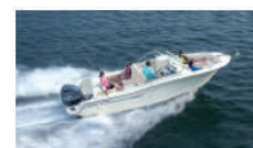
Freedom 235 (2016-)