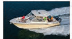
Freedom 335 (2015-)