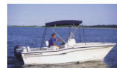
180 Fisherman (2011-)