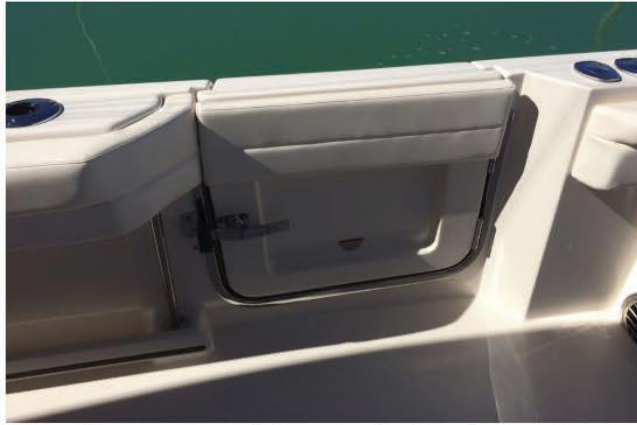
Robust hinges and latch will keep the side doors in place. Note that all coamings have large bolsters.