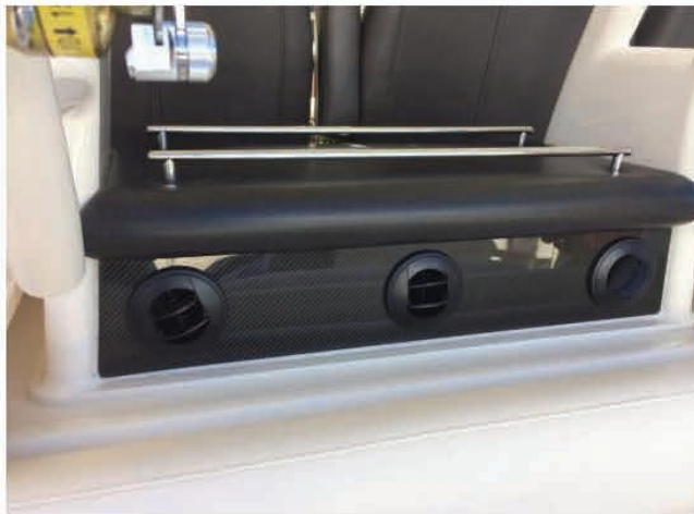
Behind the center aft-facing seat are three A/C vents to direct cool air on the three anglers or their mates.