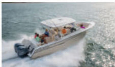
Freedom 307 (2015-)