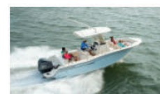
Fisherman 236 (2016-)