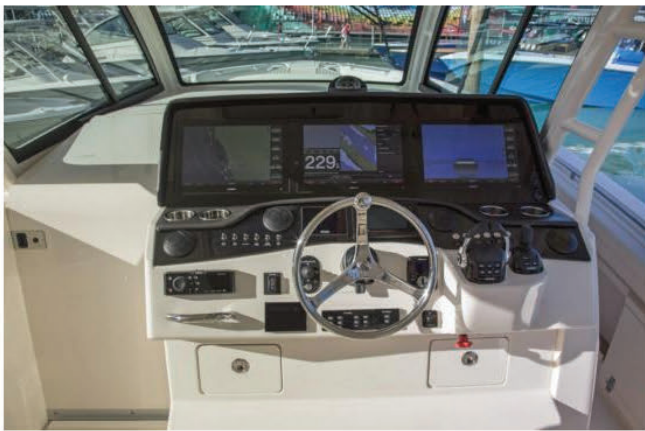
The helm is fully-enclosed on three sides with the instrument and steering wheel offset to starboard. The companionway hatch is to port. The port and starboard side panels of the windshield slide open to allow fresh air to flow through on the good weather days.

The Grady-White Canyon 456 was created for those looking for the top-of-the-line alternative to traditional sportfishing convertibles which cost several million dollars, usually require a paid captain, and have annual maintenance costs that can easily go into six digits. It is also positioned for anglers wanting to move up to a sportfishing machine that is also a large, comfortable yacht, but still be easily handled. In the process, virtually every creature comfort that Grady's engineers could imagine was baked into the boat.