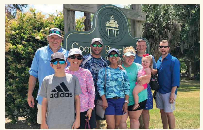
THE NEW COASTAL EMPIRE CLUB hosted its first event boating to Defauskie Island in May. Four boats and 11 people made the trip.

Here are highlights from recent Grady Owners' Clubs events and outings. If you have Grady club information to share or are interested in information about Grady clubs in your area, email anchorline@gradywhite.com. Go to www.gradywhite.com for links to club websites.