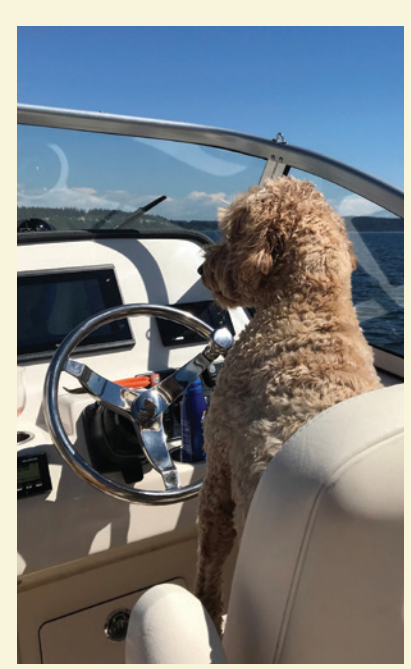
WILLY , an Australian labradoodle, loves riding around the San Juan Islands and Puget Sound in Washington state aboard Dan and Jeri Reiner's 2017 Freedom 235 .