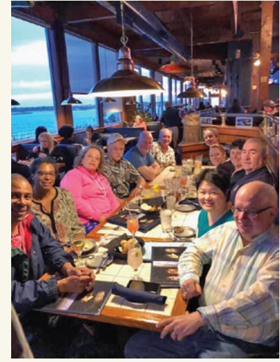
CHESAPEAKE BAY CLUB MEMBERS met for a weekend at the Ocean 1 Hotel in Ocean City.

In April, the Chesapeake Bay Club went to Ocean City for the weekend. normal club meeting, most stayed at the Ocean 1 Hotel. While the weather was still a little chilly, the ocean view was fantastic. Members met for drinks and dinner at Harrisons Harbor Watch,