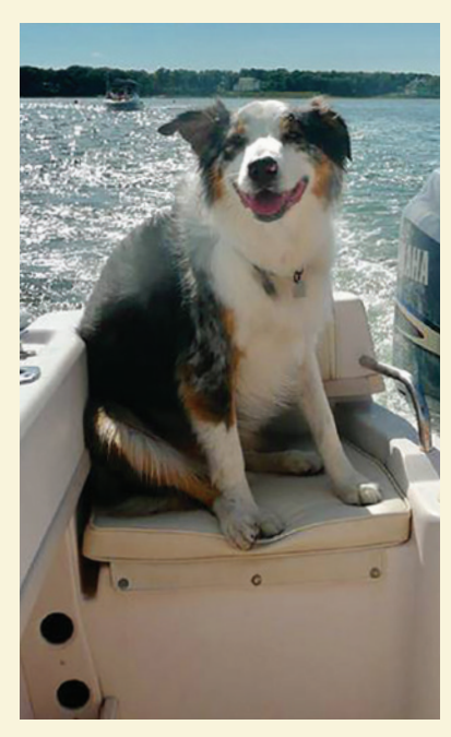
Syd and Tom Hale love their second Grady-White, a 2003 Adventure 208, with true blue boat dog, BLUE , in Cotuit Harbor, Cape Cod, Massachusetts.