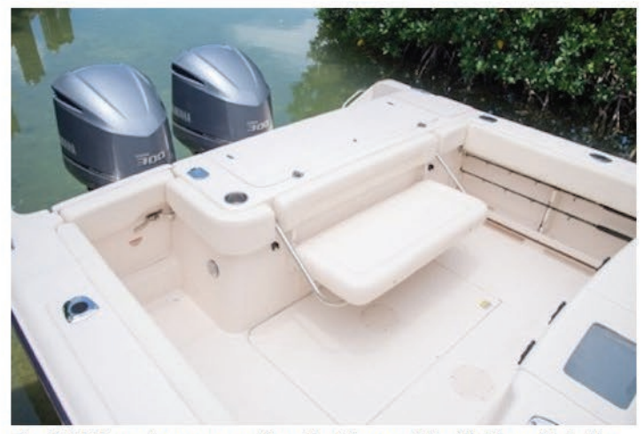
The fold-down transom seating, just forward the fishbox. Note the cup holder, as well as the rod holders visible in the gunwales.

Along the transom is fold-down bench seating, the backrest for which sits up against the 304 qt. (287.7 L) fishbox, a generously sized space for the day's catch that can fit much larger fish if needed.