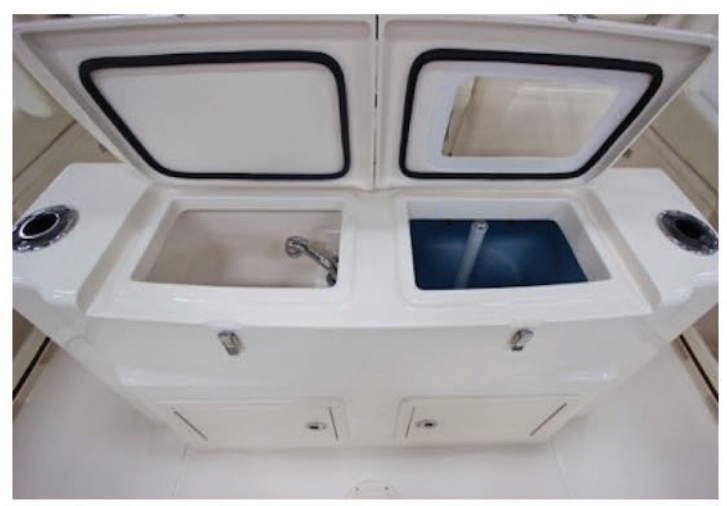
The aft side of the deluxe lean bar with 47-gallon livewell to starboard and the retractable faucet to port. Note the cup holders, as well as the tackle storage latches below.

The gunwales have dedicated rod storage, great for keeping them secure but easy-access later. The gunwales also have toe rails and bolsters to mitigate any leaning and pulling a vigorous struggle overboard may bring. Further, there is a horizontal rod storage locker in the gunwale that can fit as many as six fishing rods. Both port and starboard have three stainless steel rod holders each in the top of the gunwales.