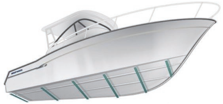
The SeaV2 Hull design has a moderate deadrise at the stern and steadily increasing deadrise forward to the bow, providing a stable yet comfortable ride.