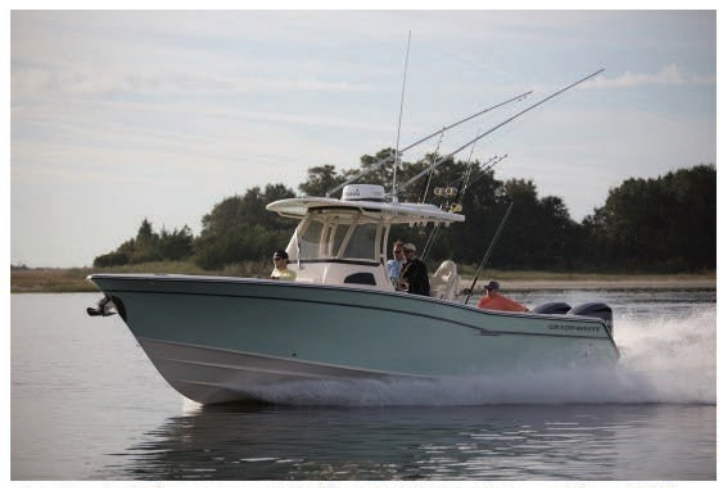
The Grady-White Canyon 306 is 30'6" (9.30 m) long with a 10'7" (3.23 m) beam and 21" (0.53 m) draft. It is a center console saltwater offshore fishing boat.