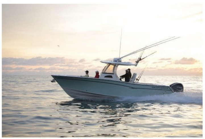
The Canyon 306 comes with a choice of three Yahama twin four-stroke engines.

The Canyon 306 can truly take advantage of that brawny build and SeaV2 hull design with tthree Yamaha twin outboard four-stroke engines: