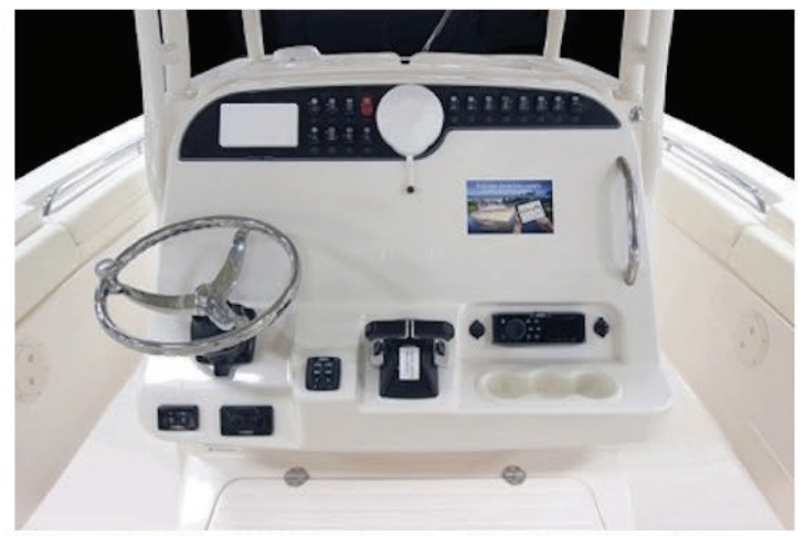
A view of the dash. Note the stainless steel steering wheel with knob.

Command elite helm chairs. The forward-facing end of the lean bar holds the helm chairs. These are Command Elite helm seats and are horizontally adjustable with arm-rests, and flip-up bolsters on both seats. A hatch in between the seats lifts up to reveal storage space.