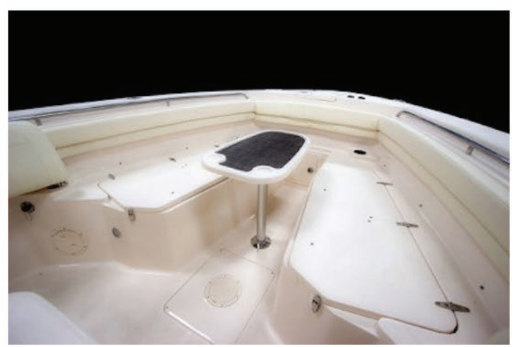
The optional fiberglass table for the bow section of the boat. Note the lack of cushions on the seating here -- they come as an option only.

The Canyon 306 is not an options-heavy boat. The lion's share of those offered are grace notes to what is largely a fishing-oriented basic package. Here are some of the more significant options offered: