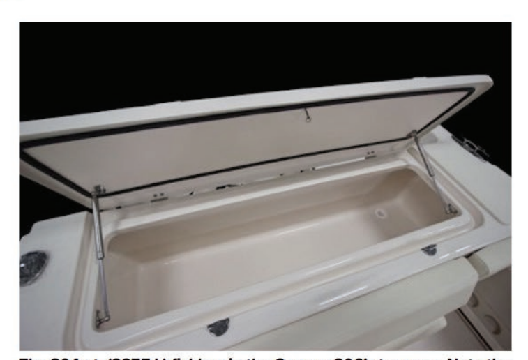
The 304 qt. (287.7 L) fishbox in the Canyon 306's transom. Note the fold-down seating is just forward, resting up against the fishbox.

Wide beam, roomy cockpit. The beam on the Canyon 306 is 10'7" (3.23 m) wide, and the space between the center console and transom is largely wide-open. This opens the boat up for quick-moving when fishing, baiting, and securing a catch in the 304 qt. (287.7 L) insulated fishbox.