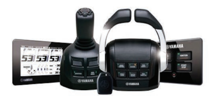
The Yamaha Helm Master system offers joystick docking capabilities, ignition control, and an information center.

One major option is the Yamaha Helm Master and an array of maneuverability enhancing items. The Helm Master upgrade comes with the ignition control, joystick docking, and the "information center" readout. This package essentially digitizes much of the control function of the boat making it easier to dock.