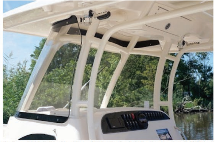
A view of the T-top hardtop. Note the lockable storage latch. Netted storage just out of frame. Notethe good visibility forward and that the supports are grounded in the console itself.

T-top hardtop. Integrated with the center console is the Canyon 306's hardtop, a fiberglass cover that has a number of features. First is storage — the netted above-head storage is a great way to get simple, light items out of the way and secure when in motion.