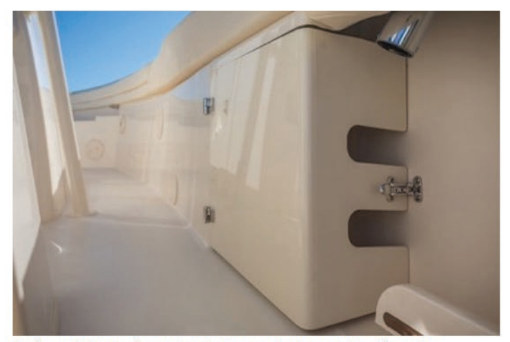
A view of the horizontal rod storage locker, molded into the gunwale.