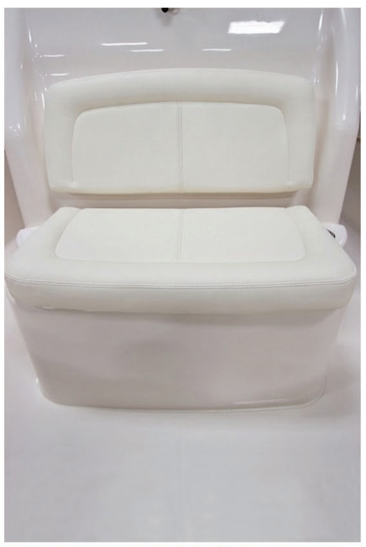
The forward-facing jump seat on the front of the center console.