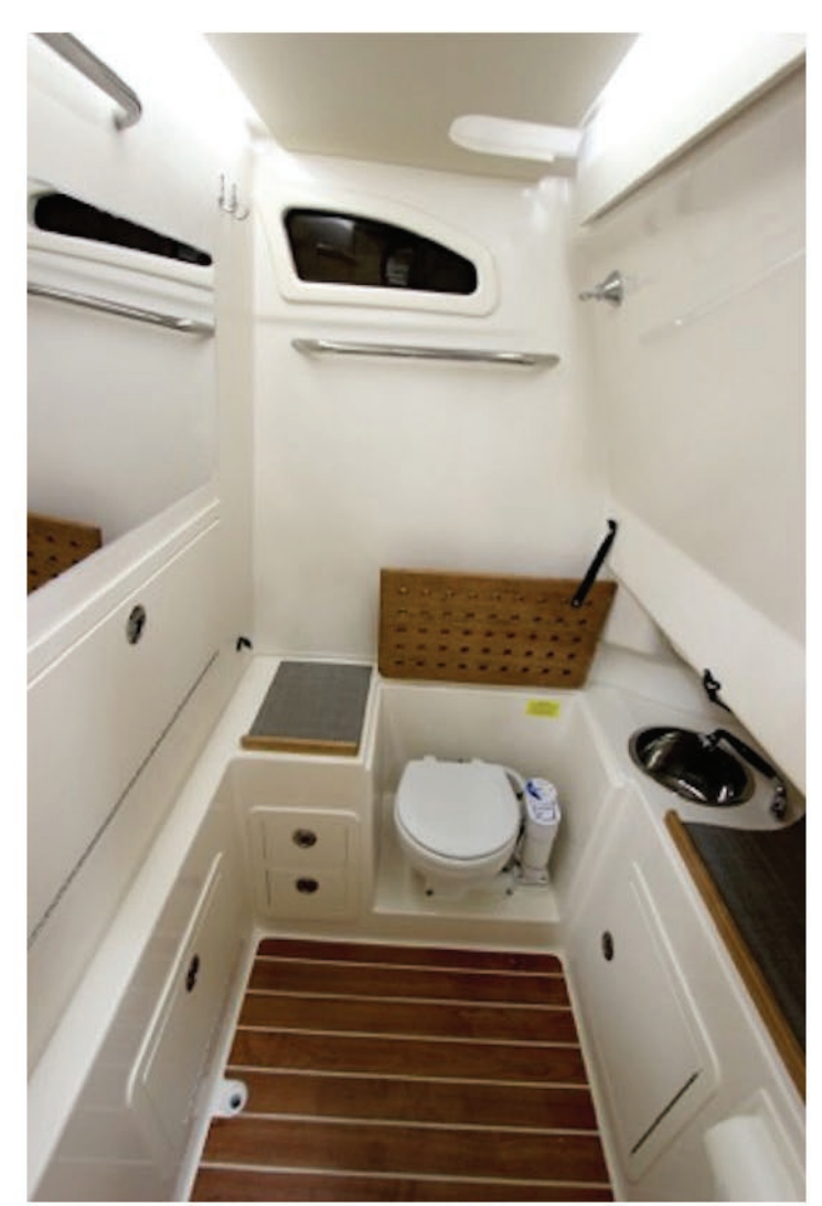
A view inside the Canyon 306's head, which has stand-up headroom, a marine head with electric flush, and a sink.

The steering wheel is 316-grade stainless steel with a knob and can be tilted as necessary. There is a storage latch just under the dash in the helm footrest as well.