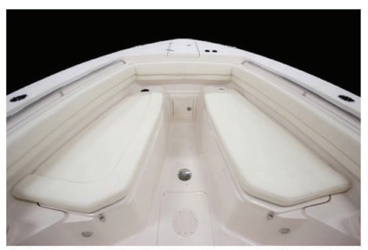
The bow seating section. Note the bolsters, the flush deck, and the windlass hatch.

Seating alongside fishing practicality. The front-facing side of the center console has a molded seat with cushions. The entire bow has bolsters around the tops of the gunwales with the deck of the bow being flush with flush-mount cleats and flush lighting to eliminate obstruction while fishing.