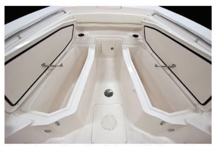
The same bow seating section with the seats lifted to reveal the twin 150 qt. (142 L) fishboxes underneath.