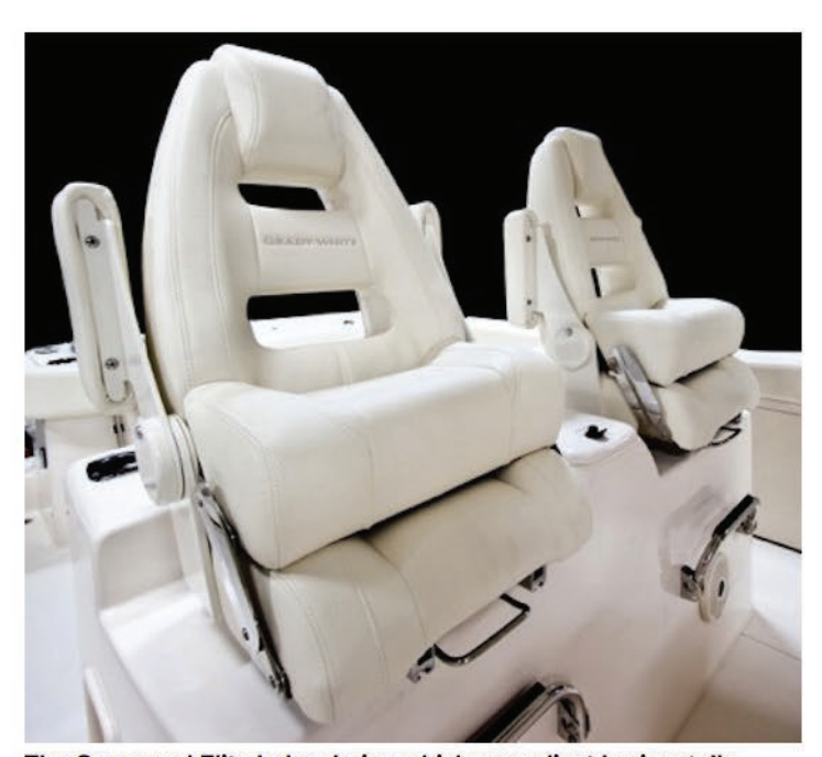
The Command Elite helm chairs, which can adjust horizontally. Flip-up bolsters are up; note the storage latch in between chairs.

Command elite helm chairs. The forward-facing end of the lean bar holds the helm chairs. These are Command Elite helm seats and are horizontally adjustable with arm-rests, and flip-up bolsters on both seats. A hatch in between the seats lifts up to reveal storage space.