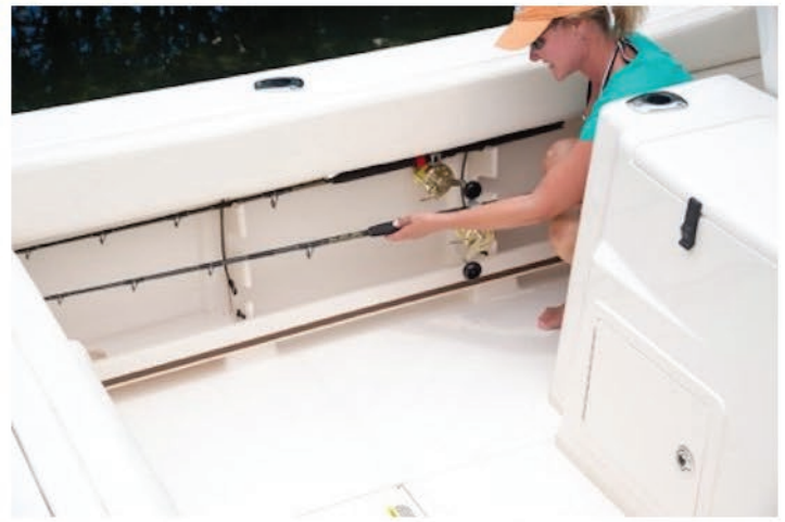
Rod storage that keeps them secure and easily accessible.

Along the transom is fold-down bench seating, the backrest for which sits up against the 304 qt. (287.7 L) fishbox, a generously sized space for the day's catch that can fit much larger fish if needed.