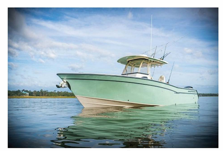
A roomy, rugged, comfortable boat built for fishing.

Simply put, the main attractions for the Canyon 306 is the quality of the ride, the over-all look, the practical design, and the rugged construction that Grady-White is known for. So, while this is primarily a saltwater offshore fishing boat, there may be a tendency to want to open its use up to other types of excursions.