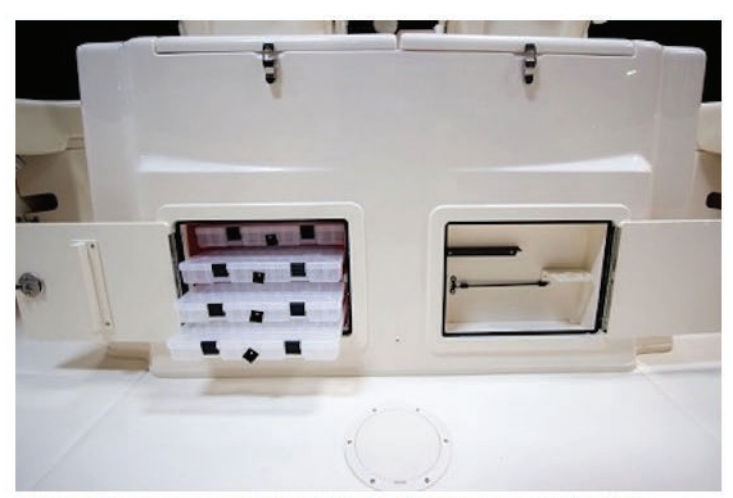
The tackle storage on left and the bulk storage on right at the bottom part of the deluxe lean bar in the cockpit.