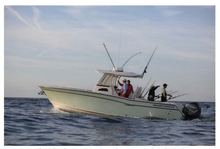
Not shown in this picture, but there is a rear swim platform, including a retractable reboarding ladder.

Swim platform. The Canyon 306 comes with the option of three different Yamaha four-stroke dual outboard engines, which rest on the integrated outboard mounting system that doubles as a swim platform. The platform has a reboarding ladder that telescopes and fits into a molded-in space on the platform.