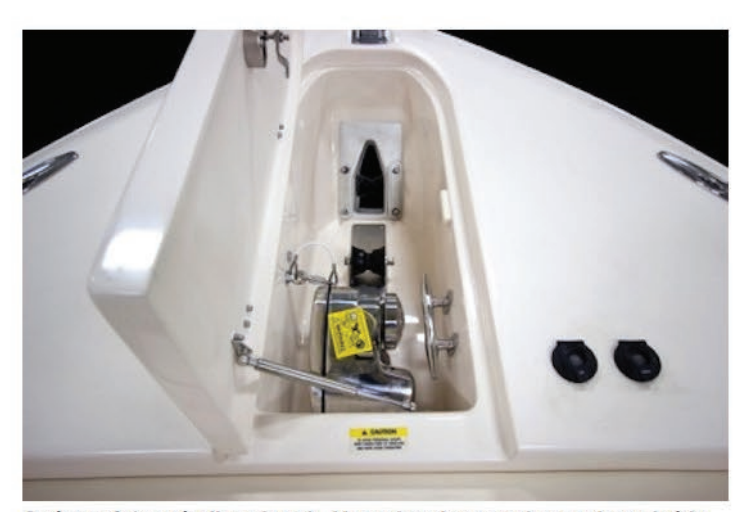
A view of the windlass hatch. Note the cleat on the starboard side of the compartment. This is important because the windlass should not be used as a cleat as some builders do.