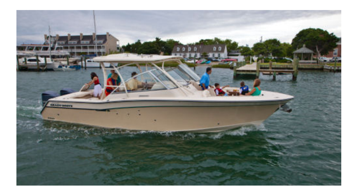
Eight people are on this boat and she is not even close to capacity. We guess that 15 could be handled on deck.

Entertaining is one of the things that the Freedom 335 is all about. Note five people are in this cockpit, but there is room for a couple of more -- and then there is the rest of the boat. Kids can be in the bow and adults astern or whatever.