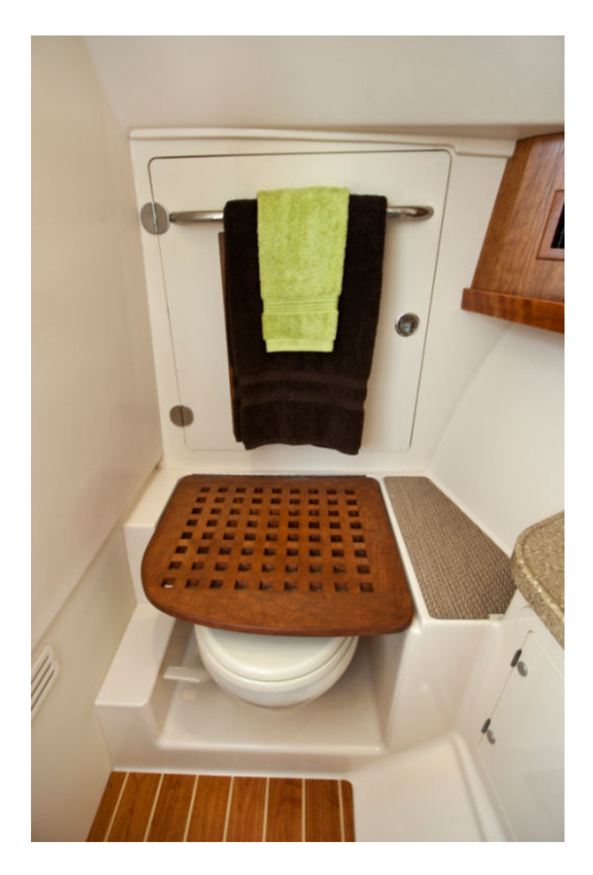
The teak grate makes it easier to sit and shower, or to sit and get dressed for that matter.