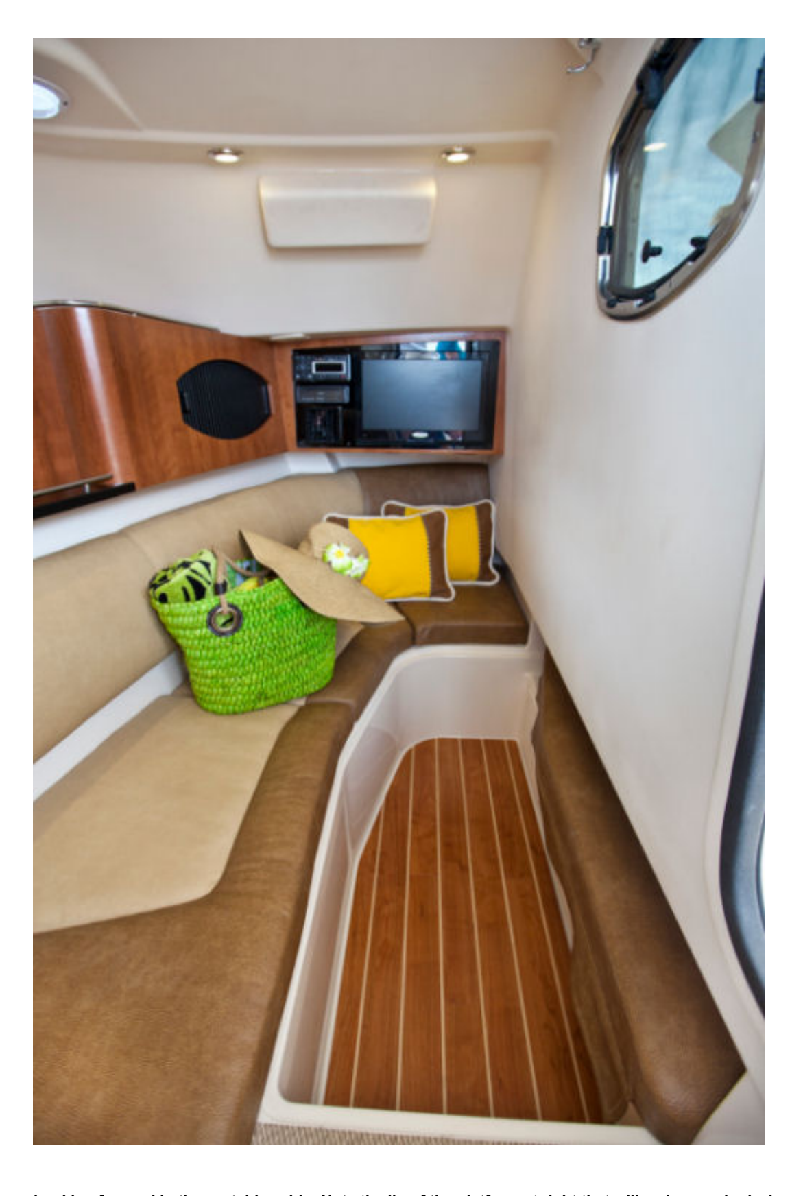
Looking forward in the portside cabin. Note the lip of the platform at right that will make up a bed when electrically activated.