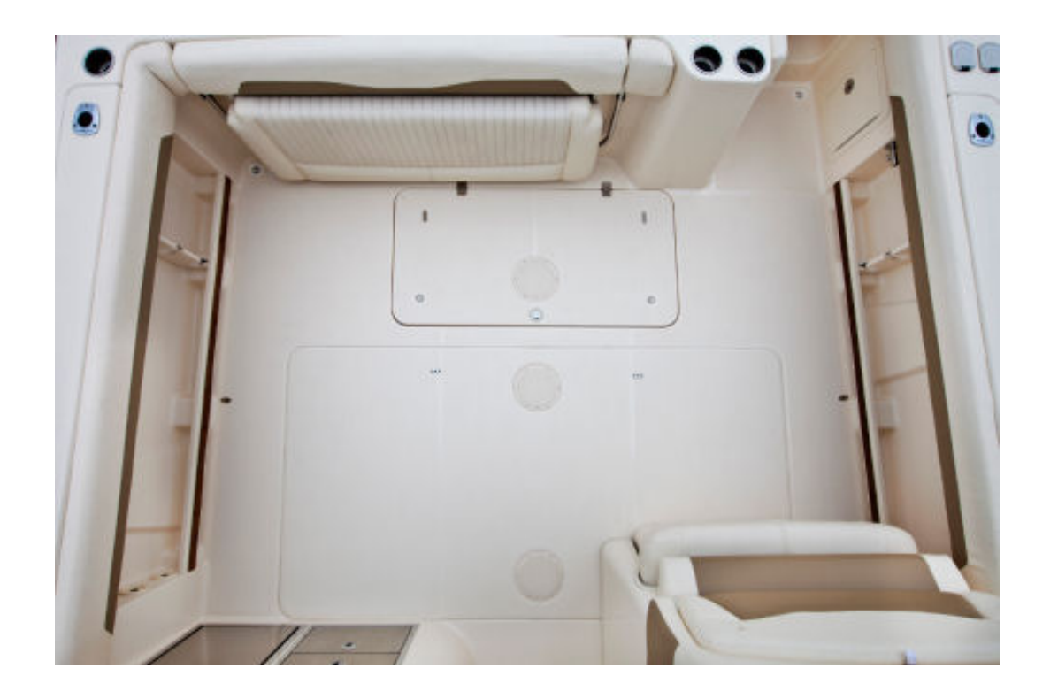
Bird's eye view of the aft cockpit with the fold away transom seat out of the way and the electrically actuated seat to port retracted.