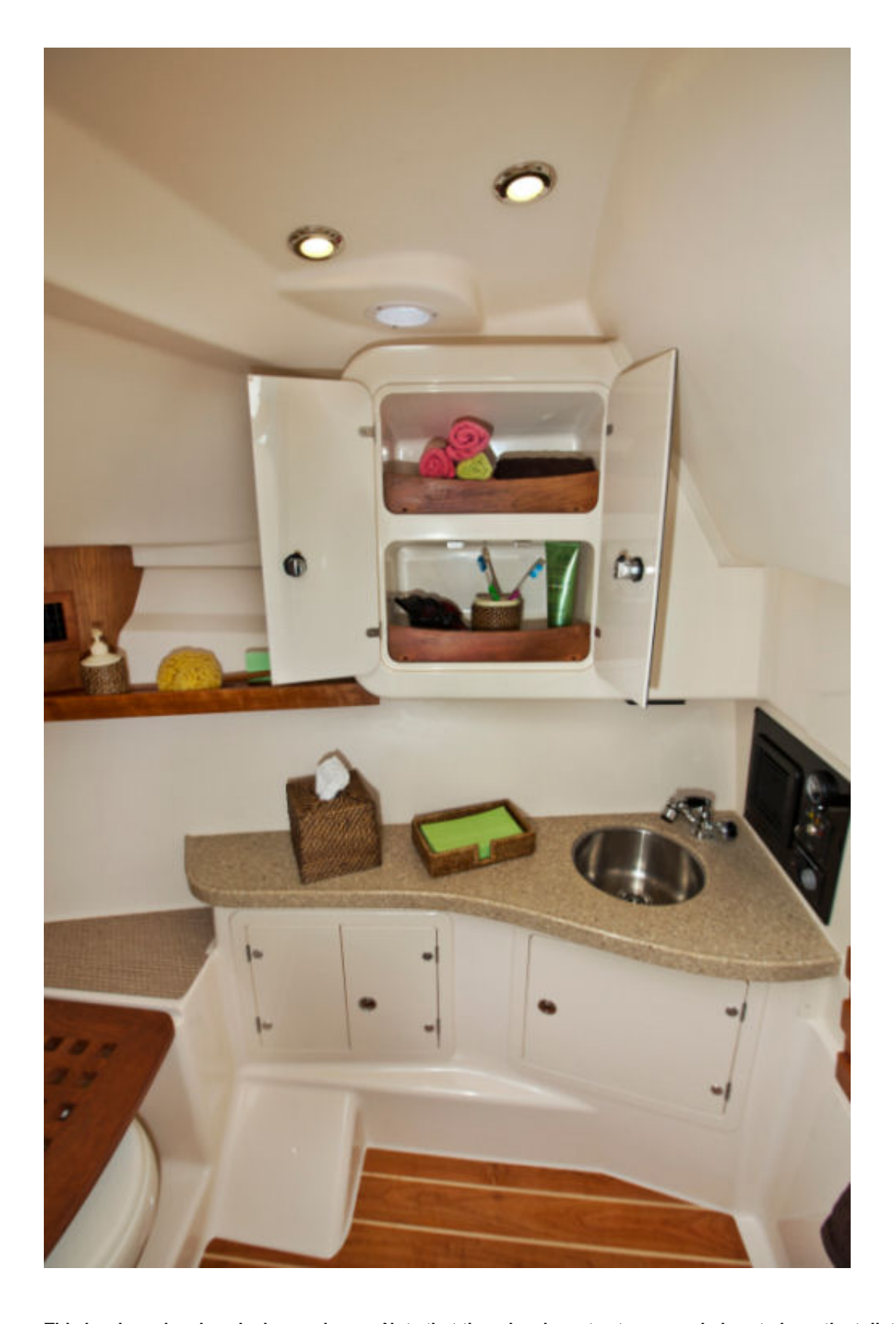
This is a large head as dual consoles go. Note that there is adequate storage and place to keep the toilet paper dry.