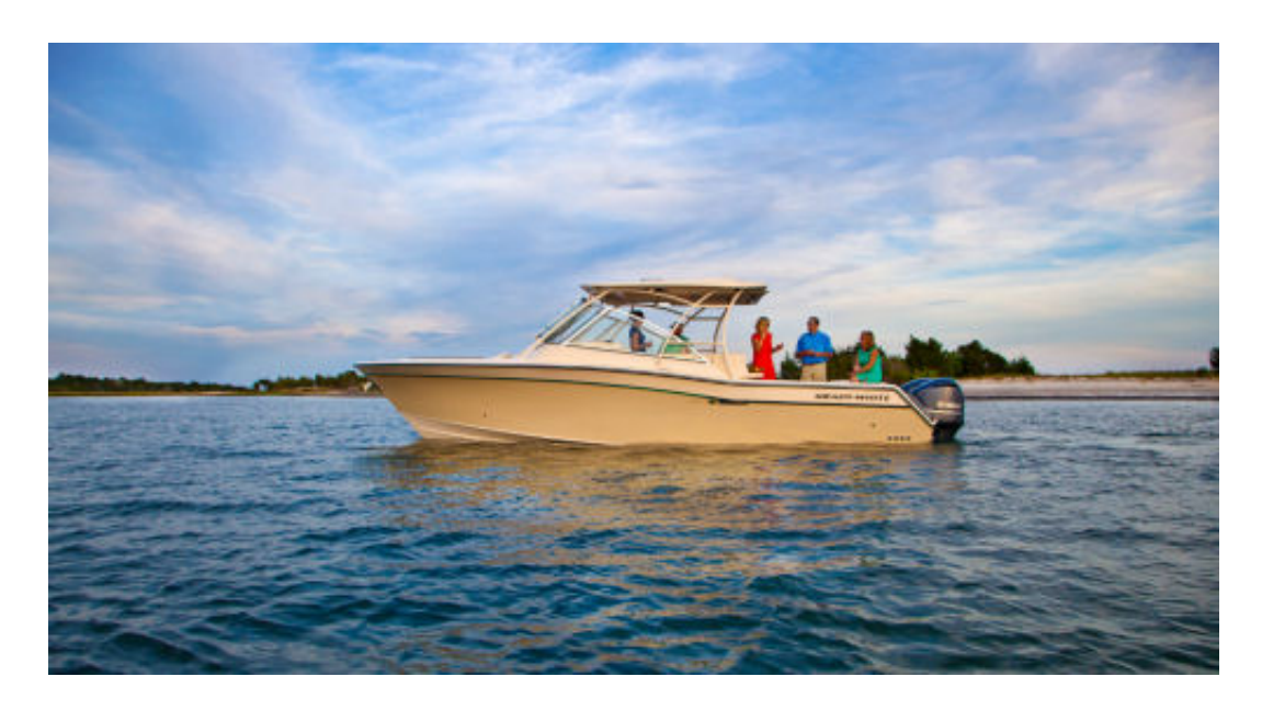
The 335 in profile accentuates the Carolina Flare and sheer line and demonstrates the higher freeboard forward. The aft cockpit has a depth of 29" (.74 m) which keeps the little ones secure.

Exterior Design. Her trademark Carolina Flare bow and sheerline are beautifully executed in the 33 ft hull. Her freeboard forward is higher, her bow is sharper, and the dark navy cove stripe that follows the sheer is classically elegant. But what really catches our eye is the two-tone topsides that make her look a lot more exciting. The result is a profile that is both arresting visually and practical for offshore work both fishing and cruising.