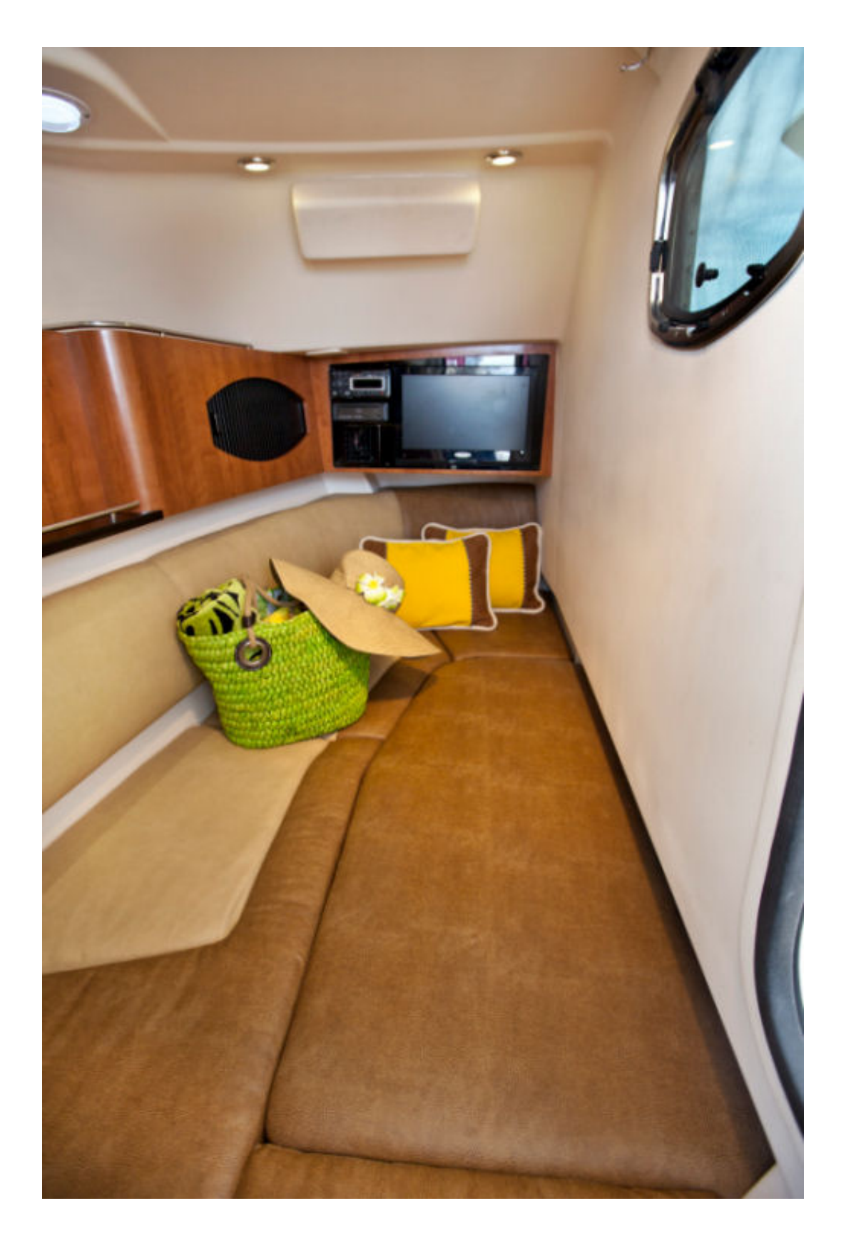
When the platform is deployed there is enough room for one person to comfortably take a nap; perhaps two can fit if they cuddle up.

Cabins Below. A special feature of the 335 is tucked into the port console. This makes an ideal changing room for people wiggle out of their wet bathing suits and putting on dry clothes. The compartment is large and has a bench seat that can hold three or four people setting. Kids will love to play down there or hang