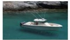
Canyon 376 (2016- )

To the starboard side there are under gunwale rod racks, a fresh and raw water washdown, and toe rails for added support when working a fish. Interestingly, these toe rails are slightly lower than those that we usually see. While we don't typically measure these things, we've always noticed that there's typically a lot of room to raise the feet before the rail starts to add its support. Here, the feet are snug to the rail even when flat on the deck.