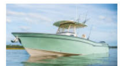
Canyon 306 (2017-)