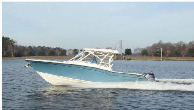
Once on plane, the SeaV2 hull design keeps the Freedom 325 on plane at lower speeds.

Thanks to her SeaV2 hull, we reached planing speed in 3.5 seconds, accelerated to 20 mph in 5.3 seconds, and 30 came and went in 8.2 seconds. About seven clicks of the engine trim gets her into her running attitude. We did notice that if we accelerated slowly, she needs to be pushed to get her up on plane, but once up there, she'll stay planing down to a much lower speed setting. Such is one of the many benefits of the hull design. More efficiency at lower speeds.