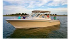
Freedom 335 (2013-)