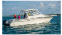
Express 330 (2015-)