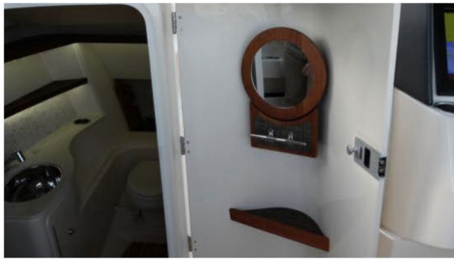
Mounted to the inside of the door is a mirror, an ornamental cleat that serves as a pull handle to close the door, and a small storage shelf.