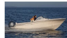
Freedom 215 (2017-)