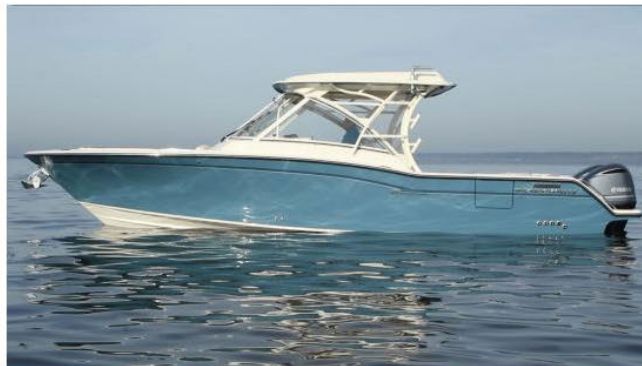
The Grady-White Freedom 325 has a LOA of 33'1" (10.08 m), a beam of 10'9" (3.28 m), and a draft of 24" (61 cm).