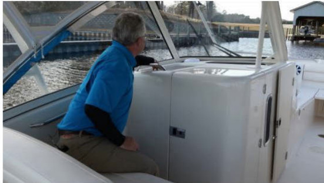
Ahead of the observer is a place for laying items, which is in front of a grab handle.