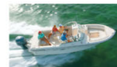
Freedom 225 (2015-)