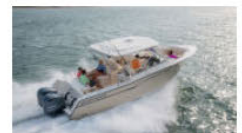
Freedom 307 (2015-)