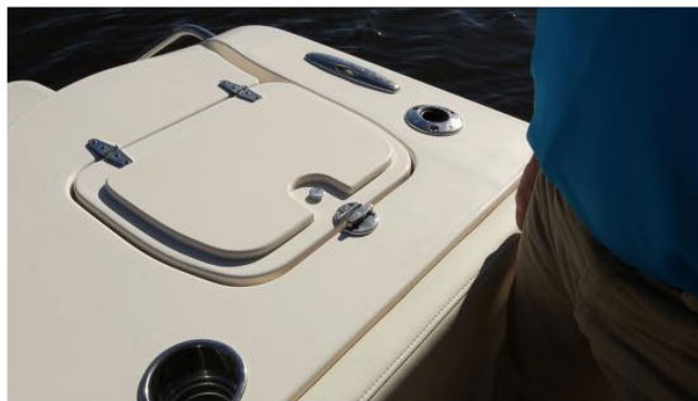
The top of the livewell serves as a cutting board.

Fishing features start with the padded bolsters that start at 20" (51 cm) and top out at 25" (64 cm). Four caprail mounted rod holders surround the cockpit. At the transom, there's a 32-gallon (121 L) livewell with the usual features of blue interior, rounded edges, etc. The lid serves double-duty as a cutting board. In the center of the transom is a 254-quart (240 L) fishbox, saving us the trouble of opening a deck hatch to store our catch. When it gets limited out, another 180-quart (170.34L) insulated box is under the bow seating. Under the livewell is a pull-out panel holding a pair of tackle sorters.