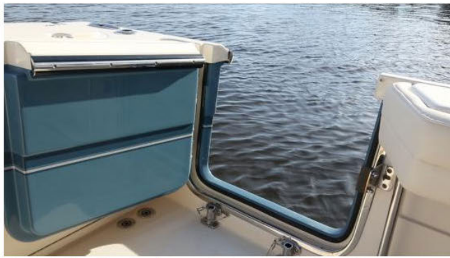
The hull side dive door is standard on the Freedom 325.