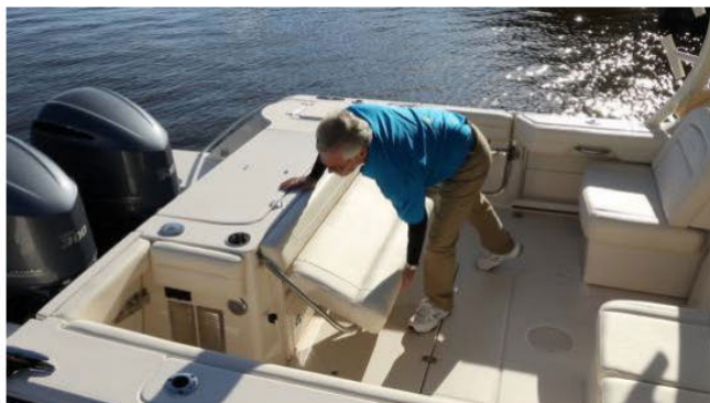
Just grab the bottom of the seat and lift.

Seating is Another Aspect Where the Freedom 325 Shines. It has the pull-out transom bench seat in the usual position, but Grady-White seems to have a good take on the ease of use. Just pull up the bottom and it turns into a seat. No mussing or fussing. Even better is the way it stows. Grab the two sides at the rear and lift, and it can be dropped back down into the flush stowed position. At first attempt, this feels like the side frames are going to trap one's hand and crush their fingers, but it's not even close. It just takes one try to see that, and then it's sort of a relaxing feeling knowing how safe from harm it actually is.