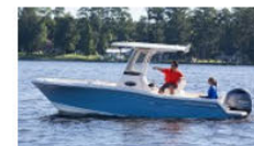
Fisherman 216 (2018-)