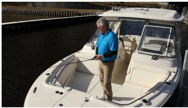
With the cushions removed, a casting deck is created.