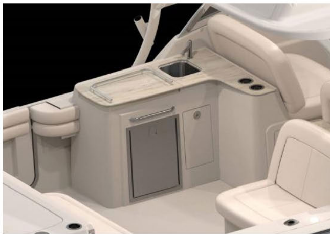
The seat to the port side can be swapped out for an optional refreshment center that includes a sink, electric grill, refrigerator, counter prep area, and storage (artist rendering only).