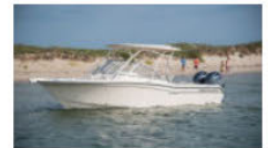
Freedom 255 (2015-)