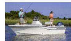
Fisherman 180 (2015-)