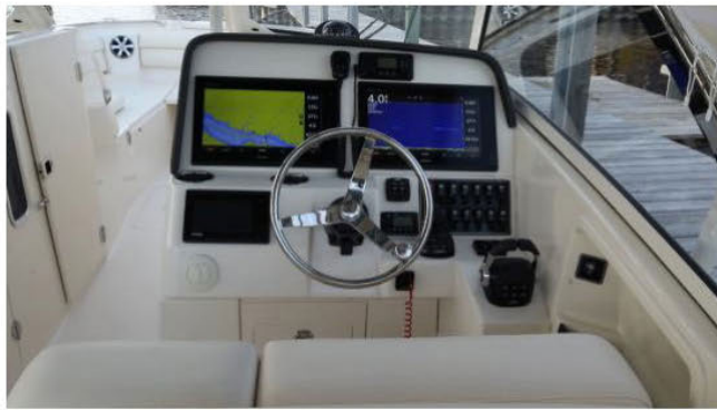
The helm does not include the displays, those are added by the owner.