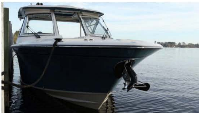
The anchor is mounted through the stem.