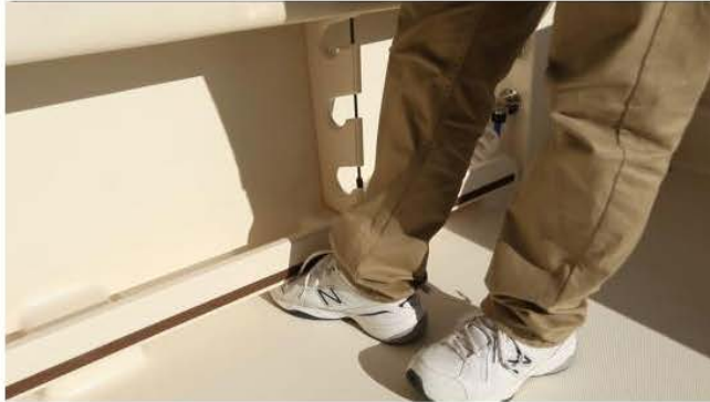
Notice how the toe rail is snug to the feet instead of being much higher like we normally see.

And then there are the four rod holders to the aft side of the hardtop supports, the aft-mounted spreader lights, and the reinforced sections of the hardtop for supporting outriggers. And of course it bears mentioning that virtually everything that can collect water on this boat is also designed to drain that water so that the whole boat transitions from hard fishing to family and entertaining, with little more than a few minutes with a hose.