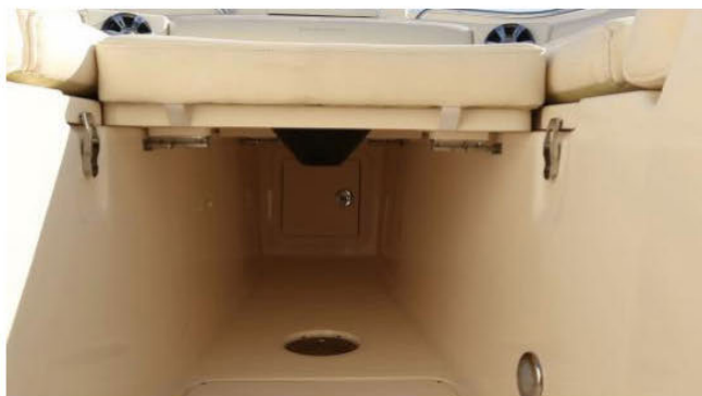
Notice how the table can rest on, and then latch into, ledges to both sides. In this manner, both the sun pad and casting deck are created.