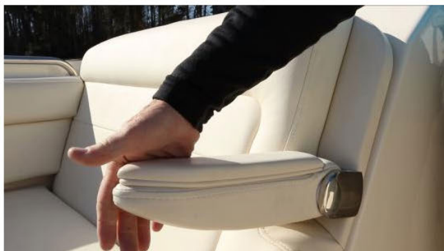
The armrests are the much-preferred flip down design. There are no latches needing to be released to deploy and stow them.