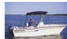
180 Fisherman (2011-)