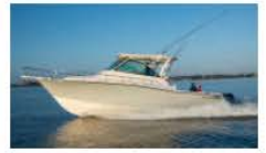
Express 370 (2017-)