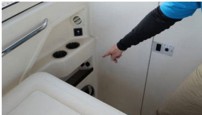
To the side of the observer there's a shelf and connectivity for the smartphones.