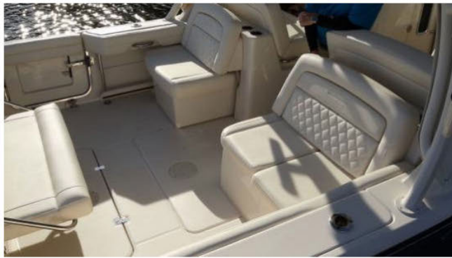
These aft facing seats form an opposing seating environment in the cockpit.