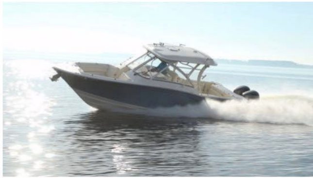
The Freedom 325 will begin her roll to initiate the turn, and then start to come about. It's a comfortable feel that adds to her sportiness.

Our turn tests were even better. The Freedom 325 turns as if on rails with a good roll that initiates the turn that negates the centrifugal force and keeps everyone well placed in the seats. We found no chine walk whatsoever, but more importantly, she rights quickly. These two combinations should prove quite beneficial when running in quartering seats. We would expect a ride with good tracking and stability. With her high freeboard of 33" (84 cm) at the stern and 47" (119 cm) at the bow, she's also ideally suited for long offshore runs. She'll also dig her shoulder in with a hard turn held on, so go ahead and add throttle to keep the speed up, otherwise shallow up the turn. With 6 ½ turns from lock-to-lock, she remains steady and stable, regardless of how heavy handed a test captain tries to get with her.