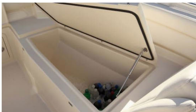
Under the starboard seat there's an insulated fishbox/cooler. It's self-draining overboard.