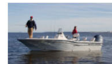
191 CE (2015-)