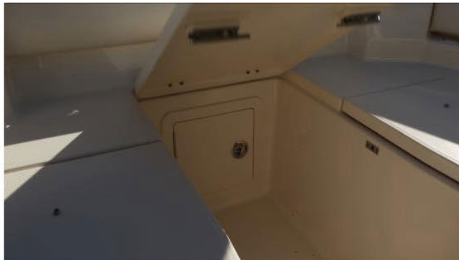
Under the forward platform is access to the rode locker.