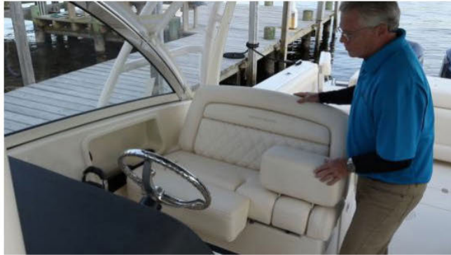
The helm seat includes separate flip-up bolsters.