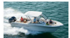
Freedom 275 (2016-)