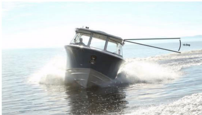
We measured a maximum roll angle of 15-degrees during typical maneuvering.

Our turn tests were even better. The Freedom 325 turns as if on rails with a good roll that initiates the turn that negates the centrifugal force and keeps everyone well placed in the seats. We found no chine walk whatsoever, but more importantly, she rights quickly. These two combinations should prove quite beneficial when running in quartering seats. We would expect a ride with good tracking and stability. With her high freeboard of 33" (84 cm) at the stern and 47" (119 cm) at the bow, she's also ideally suited for long offshore runs. She'll also dig her shoulder in with a hard turn held on, so go ahead and add throttle to keep the speed up, otherwise shallow up the turn. With 6 ½ turns from lock-to-lock, she remains steady and stable, regardless of how heavy handed a test captain tries to get with her.