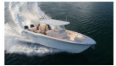
Canyon 336 (2015-)