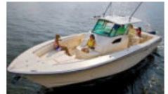
Canyon 366 (2011-)