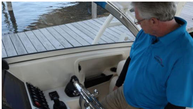
Here's another padded area for the cell phone, complete with connectivity. A beverage holder is just behind.