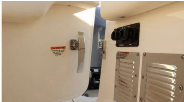
This easy to operate handle opens with a pull towards the operator, and then rotates down to open.

Seating is Another Aspect Where the Freedom 325 Shines. It has the pull-out transom bench seat in the usual position, but Grady-White seems to have a good take on the ease of use. Just pull up the bottom and it turns into a seat. No mussing or fussing. Even better is the way it stows. Grab the two sides at the rear and lift, and it can be dropped back down into the flush stowed position. At first attempt, this feels like the side frames are going to trap one's hand and crush their fingers, but it's not even close. It just takes one try to see that, and then it's sort of a relaxing feeling knowing how safe from harm it actually is.