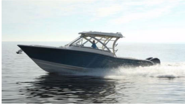
Grady-White's SeaV2 hull didn't get the workout we were hoping for on our test, but we got quality handling characteristics even in calm conditions.

The Grady-White Freedom 325 has a LOA of 33'1" (10.08 m), a beam of 10'9" (3.28 m), and a draft of 24" (61 cm). With an empty weight of 9,300 lbs. (4,218 kg), half fuel, two people and test power, we had an estimated test weight of 11,708 lbs. (5,311 kg).