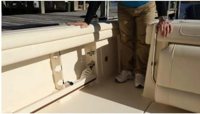
Under gunwale rod storage, fresh and raw water washdowns and a toe rail are all to the starboard bulwarks.