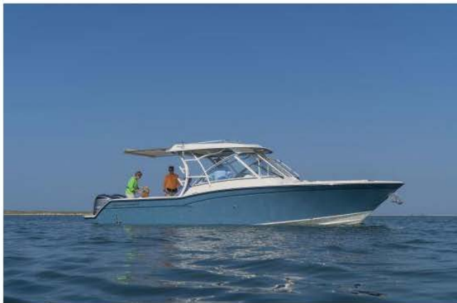
The standard hardtop not only includes the fishing features mentioned, but also tri-color LED lighting, a storage bag, speakers, and an extendable awning that retracts flush with the trailing edge.

And then there are the four rod holders to the aft side of the hardtop supports, the aft-mounted spreader lights, and the reinforced sections of the hardtop for supporting outriggers. And of course it bears mentioning that virtually everything that can collect water on this boat is also designed to drain that water so that the whole boat transitions from hard fishing to family and entertaining, with little more than a few minutes with a hose.