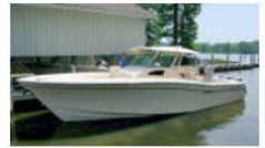
Canyon 366 (2009-)