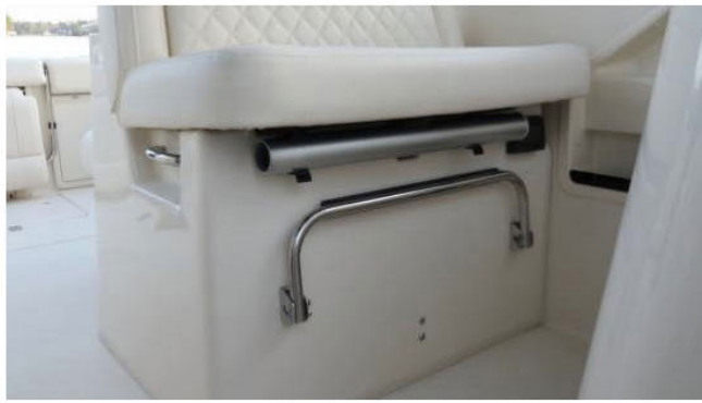
The observer's seat includes a flip-down footrest. Just above it is dedicated storage for the table pedestal.