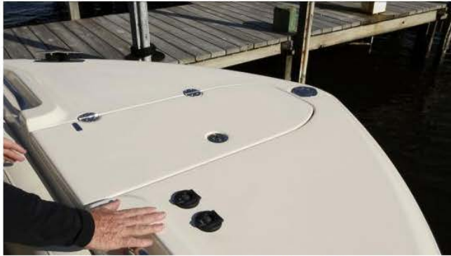
Foredeck features retractable and flush mounted hardware to maintain a snag free surface.

The hatch is held open by a stainless steel support strut. Inside, is an electric Pro Fish windlass leading out to a through-the-stem anchor roller. There is a safety wire attached to the port bulkhead. A cleat is to starboard for securing the rode and taking the strain off of the windlass. Controls are to the right of the hatch and additional controls are at the helm.