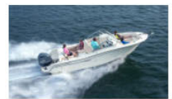
Freedom 235 (2016-)