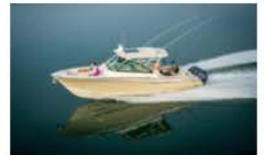
Freedom 375 (2015-)