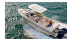
Gulfstream 232 (2015-)