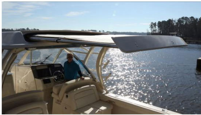
The hardtop also includes a retractable awning that is flush with the trailing edge when retracted. Fully extended it comes out 5'5" (1.65 m).