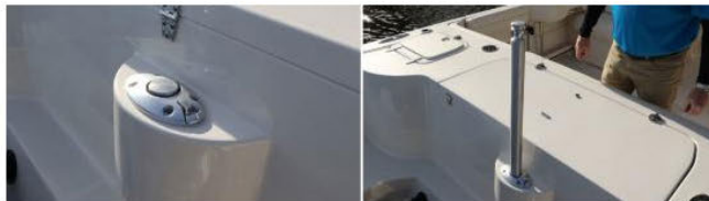
The ski tow pylon retracts into the transom. Release the button to the side and lift. It then locks into the raised position.

As a dive platform, the standard hull side dive door to the port side of the cockpit will be a welcome addition. And we noticed that both this dive door and the aft cockpit door are fitted with latch handles that can easily be opened with one hand. Others require both hands to open, one to release a latch, the other to manipulate the handle. We suspect this will not go unnoticed by those other builders.