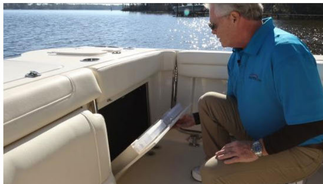
Here's a clever use of space. The narrow void area, just ahead of the livewell base, houses a pair of tackle sorters on a pull-out panel.