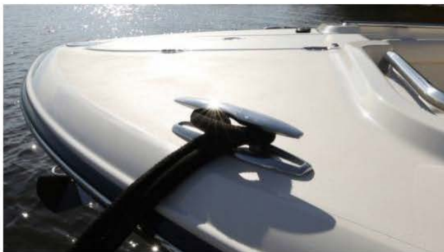
Six 8" (20.32 cm) pull-up cleats are located throughout the boat. And remember, they're self-draining.