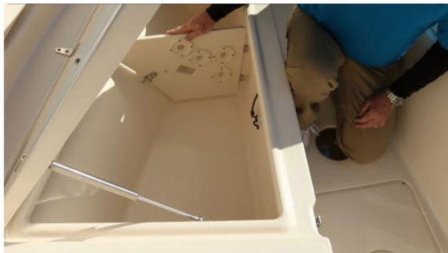
Under the port seating is open storage, or rod storage. This swing away panel, and another aft at the port console bulkhead, facilitates switching between the two.