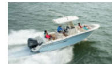
Fisherman 236 (2016-)