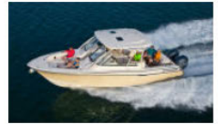
Freedom 335 (2015-)