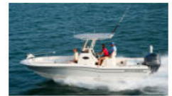
251 CE (2015-)