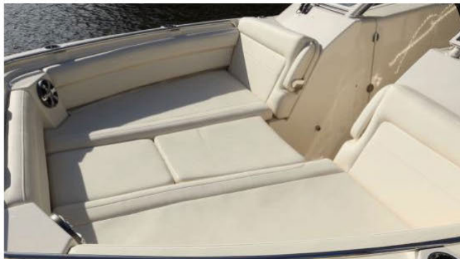
We can lower the table and add cushions to form a sun pad.