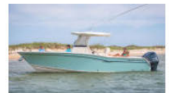
Canyon 271 FS (2016-)