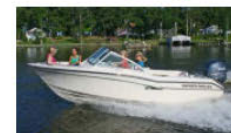
Freedom 192 (2015-)