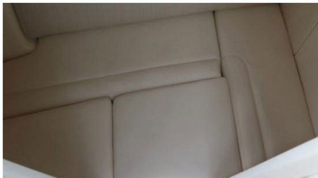
With filler cushions, the starboard console becomes a sleeping area.