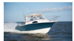
Marlin 300 (2017-)