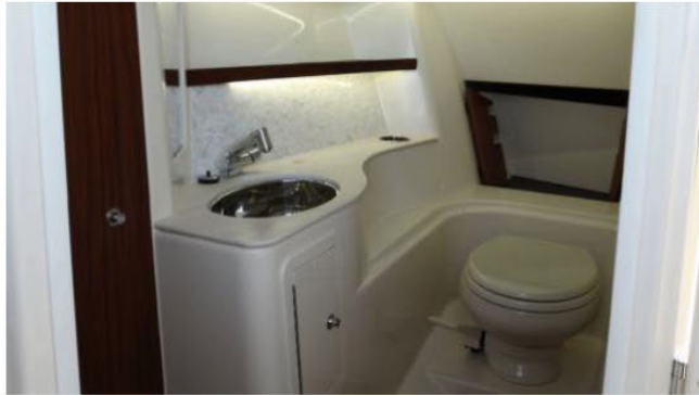
The head compartment is well appointed. Forward we can see how the bulkhead is open to the bow storage compartment to accommodate rod storage.

The starboard console is now designated for storage, sitting and, should the need permit, sleeping. That bed will measure 6'1" (1.85 m) in length. Overhead clearance is 5'2" (1.58 m).