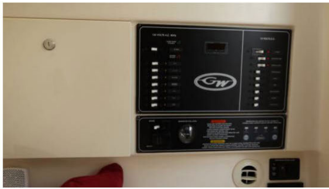
The main switch panel is located at the aft bulkhead of the starboard console.