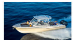
Freedom 285 (2016- )