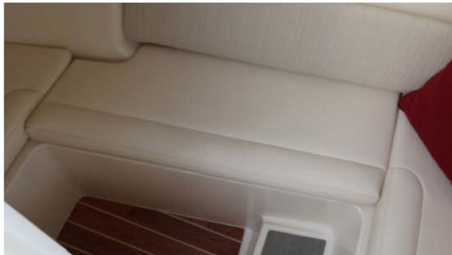
Inside the starboard console is a comfortable sitting area that can also be used as storage.

The starboard console is now designated for storage, sitting and, should the need permit, sleeping. That bed will measure 6'1" (1.85 m) in length. Overhead clearance is 5'2" (1.58 m).