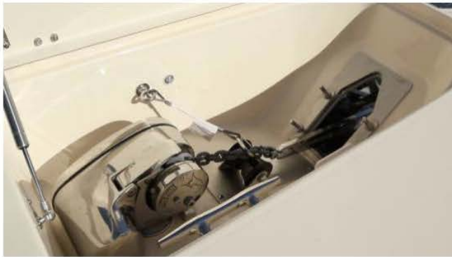
The windlass is underneath the hatch, and a gas strut holds the hatch open. The anchor is mounted on a through-the-stem roller. Control switches are just to the right.