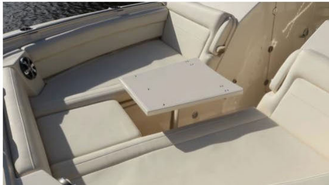
A pedestal table can be added to the bow area to increase its utility. Notice the speakers up forward, and how they are facing aft.

We can add a pedestal table to increase the utility of the bow area and turn it into a snack/cocktail area. We can remove the pedestal and lower the table, and then add cushions to form a sun pad. It's important to note that when doing this, a shorter pedestal is not required. The table sits on small ledges to both sides that act as supports. And of course, with the cushions removed, a large casting deck is created.