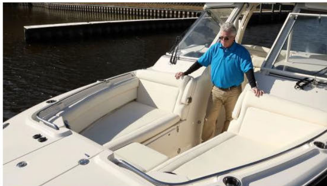
The bow area is comfortable and spacious. Here we can see the padded bolsters, grab rails, beverage holders, the stowed armrests, and the reclined angle of the lounge seatbacks.

The bow area consists of two forward facing lounges 5'10" (1.78 m) in length, 33" (84 cm) wide with 2' (.60 m) between the two seats. This translates to seats that are seat-and-a-half width with plenty of room for occupants to face each other without knocking knees together. The lounges include seatbacks that are comfortably reclined. Flip-down armrests are to the inboard sides and we appreciate this design over the flip-up versions, as these don't require any unlocking or unlatching to deploy or stow.