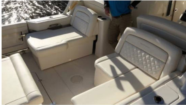
They also convert to chaise lounges at the touch of a button... actually, two buttons, one for each seat.