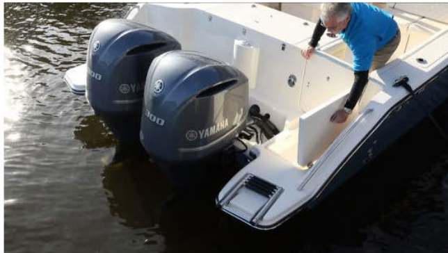
The starboard swim platform has a four-step reboarding ladder. Just ahead is a wet storage compartment for dropping the used towels into. Like every other compartment, it’s self-draining overboard.

There’s a four-step reboarding ladder to the starboard swim platform. A retractable ski tow pylon is recessed into the aft side of the transom. And a wet storage area for those used towels is just aft of the transom gate.