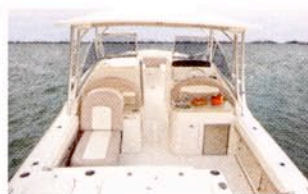
A Corian counter adds rich style to the cockpit galley.

Grady-White builds a solid, strong boat designed to give stability on plane and at off-plane speeds. Top-end performance doesn't lack either, explaining why Grady-Whites stand out