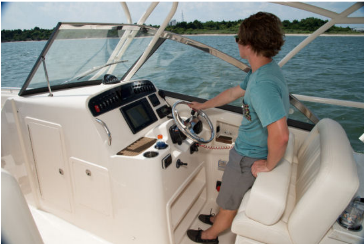
The Freedom 307's helm is large and comfortable. The cushioned helm seat is wide enough for two and adjusts forward and back electrically. Note the two foot rests in the console. The stainless steel windshield header is optional.