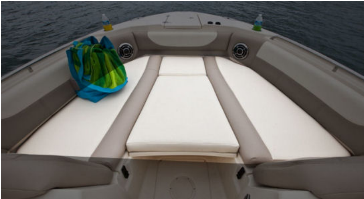
An optional filler cushion in the bow creates a huge sun pad play pen for sun worshipers.