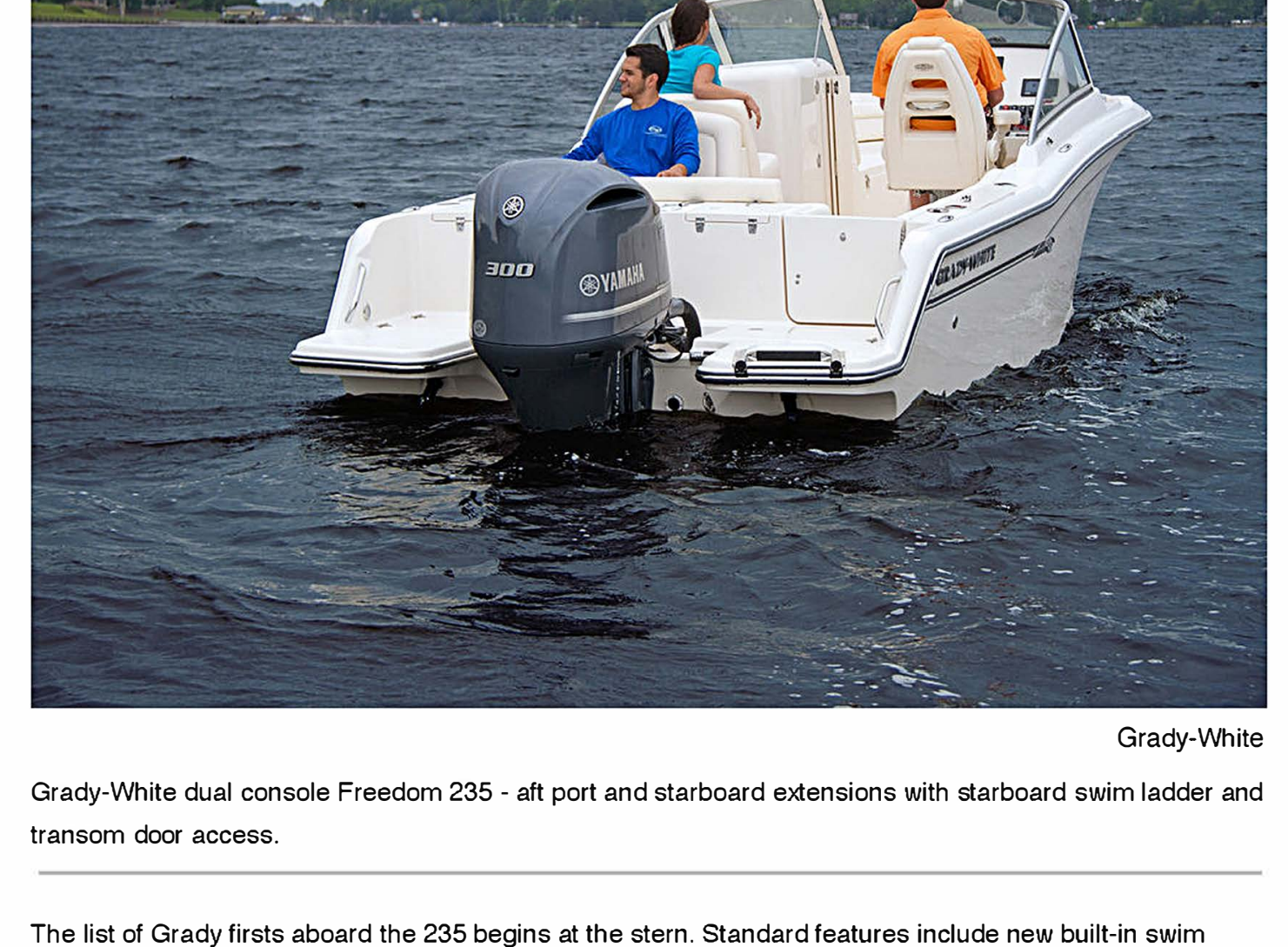
platform extensions port and starboard that double as convenient boarding platforms, and there is starboard side deck level auxiliary anchor storage as well. The starboard platform features a sturdy, four-

door a bit of a luxury aboard a 23-foot boat, Grady-White's version of this door is super safe, secure and heavy-duty with positive locking hardware that befits a much bigger vessel. Additional deck level storage also is featured on the port side, forward of the platform extension. The transom has a built-in 160-quart