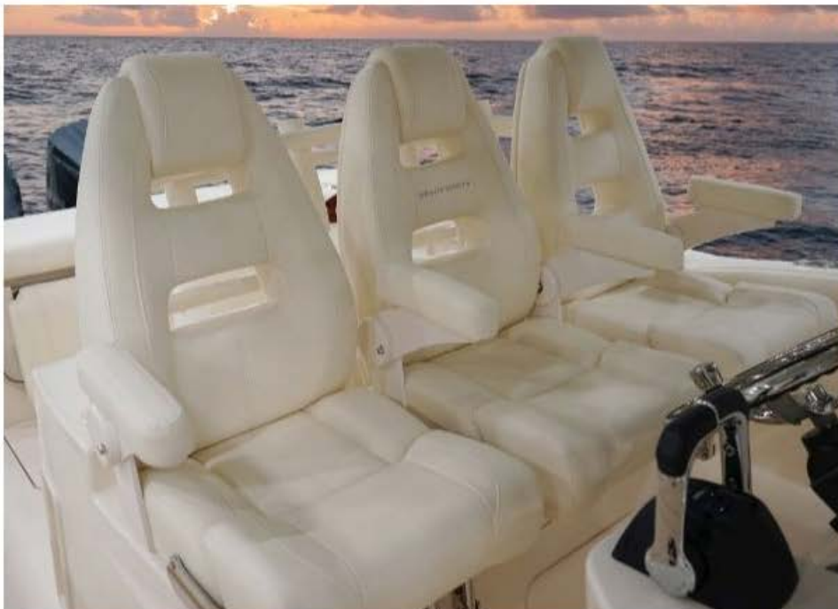
The captain and two companions can adjust the helm seats to the individual's liking.

The Helm. At the Canyon 326's helm, the seats adjust fore and aft and have folding bolsters and armrests. Footrests on the base of the helm seats console fold out and abaft are two storage drawers. In the port side of the seat base there's a fold-out wastebasket. At the dash, the steering wheel is centrally positioned with the compass in-line and accessory switches on each side. There's a shallow cushioned storage tray on the top of the console. The vertical electronics flat has space for two 17" (43.18 cm) multifunction displays and outboard to starboard are the VHF radio and Yamaha engine display. Aft are the Helm Master joystick and digital controls with the trim tab buttons with an integrated position indicator just inboard. To the left of the wheel, there's a small compartment with a fiddle rail and USB plugs, the Fusion Apollo stereo and the optional bow thruster joystick.