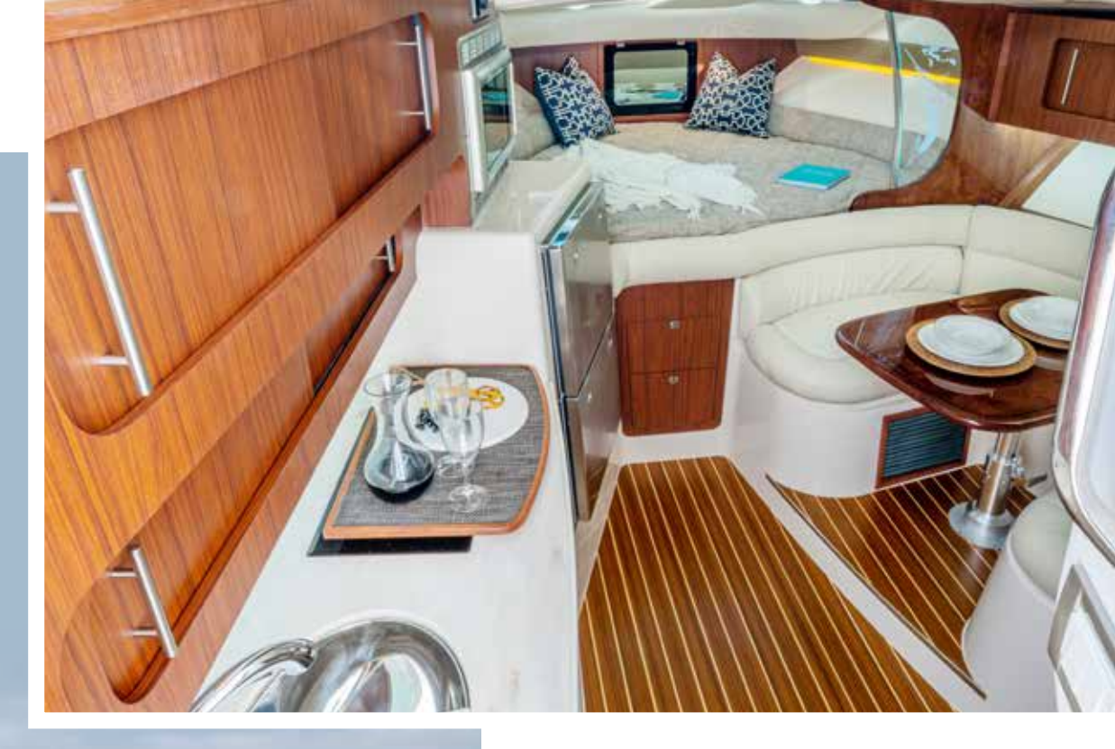
TEXT BY MIKE ROSE

Twin 425hp V8 Yamahas, push the boat to around 45