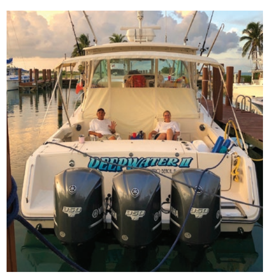
You don't even have to leave the dock to enjoy a beautiful Bahama day.