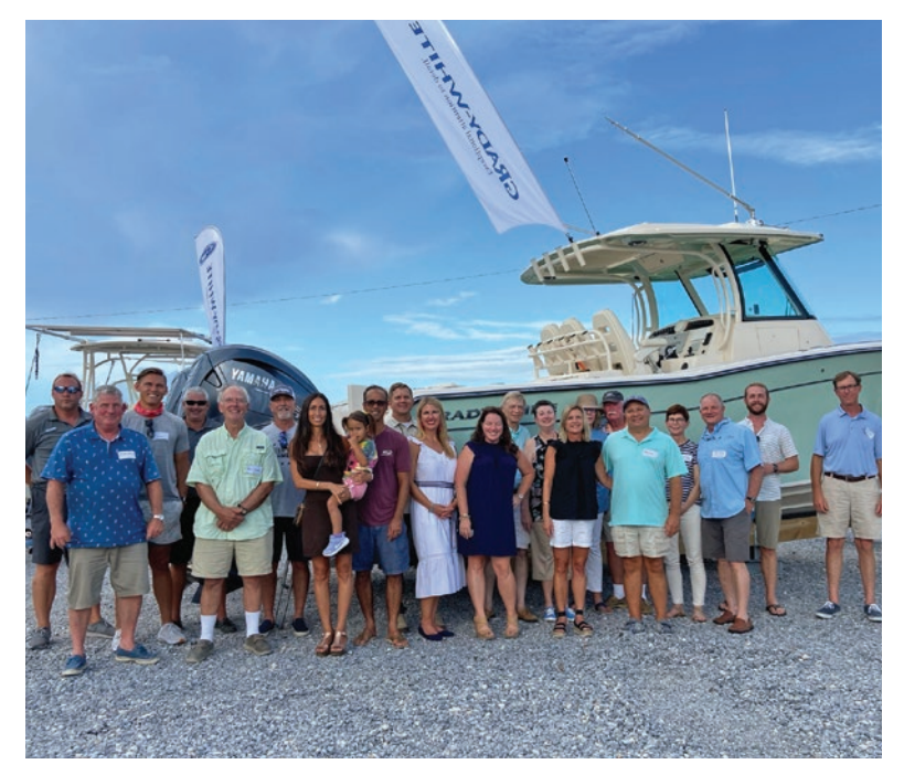
The newest Grady owners' club, the Pensacola Grady-White Club , has had several meetings and trips over the past few months. They kicked off the club at Pirate's Cove restaurant in Elberta, AL, for "Cheeseburger in Paradise," sponsored by MarineMax Pensacola. Since then, they've had several other fun-filled meetups on the water.