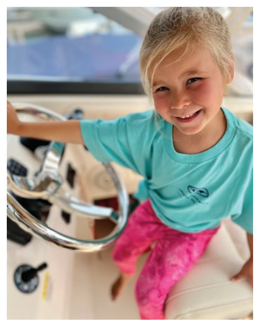
Move over Bill, it looks like this little lady will be the boat captain one day!

family as well as the obligatory ancillary gear. Once the troops are safely on the beach, the party starts in earnest. Within minutes, Oscar and Ellett, the two oldest boys, are in a debate over who gets to play