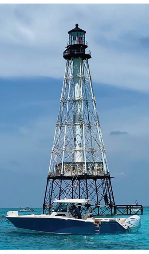
JT Stacy's Canyon 336 looks absolutely stunning in this photo taken in the Florida Keys.