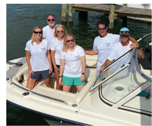
As much as they enjoy playing on the water with the grandchildren, a trip with just their girls and sons-in-law is equally special.