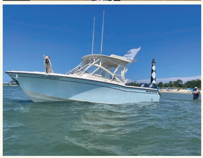
The Cape Lookout Grady-White Club held a beach-by-boat outing from Radio Island to Cape Lookout National Seashore, NC, with 19 boats, over 50 people, and nine Grady Buddies in tow. The club is a diverse group of boats ranging from 21 to 33 feet. Two of the boats had never gone to Cape Lookout before! The day was not only fun, but also provided a great opportunity for a few captains to travel a new route as there are two ways to get to Cape Lookout. One route goes out in the ocean, the other stays in the sound. You could say they attracted some attention from all the other boats at the Cape that day as all 19 Gradys anchored in front of the lighthouse together.