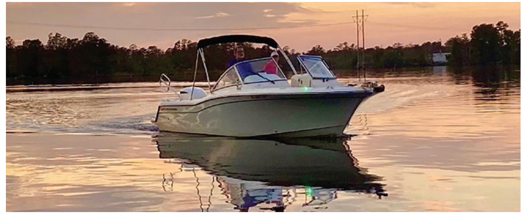
An evening cruise is the perfect ending to any day.