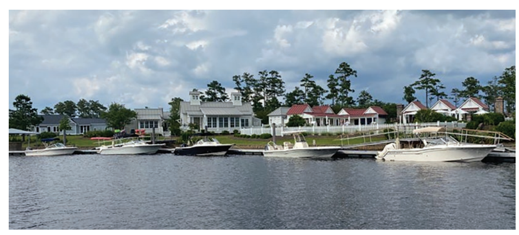
The Grady-White team enjoys spending time together away from the office. They often visit destinations for the weekend together, traveling by boat.

We also enjoy weekend excursions with our daughters, their husbands, and some of our Grady-White family. A group of about eight of us love taking off on our Gradys for a destination weekend. We've been to Ocracoke Island, NC, several times and to River Dunes Resort in Oriental, NC. It says a lot about the people I work with when, after working together all week, we still enjoy each other's company into the weekend – further proof that Grady people are great people!