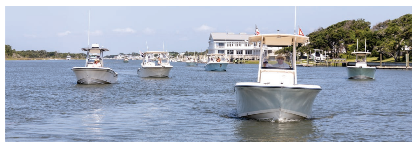
Nineteen boats from the Cape Fear Grady Club traveled to Beaufort, NC. If there's one thing the club members have learned on these overnight trips, it's to bring friends – and they did! Highlights of the trip included a pool party, cocktails on the dock, shopping, and a day trip to Shackleford Banks to anchor with the wild horses. Some of the club members also ventured to Oriental or New Bern, NC, for the day.

Here are highlights from recent Grady Owners' Clubs events and outings. If you have Grady Club information to share or are interested in clubs in your area, email anchorline@gradywhite.com. Go to gradywhite.com for links to club websites.