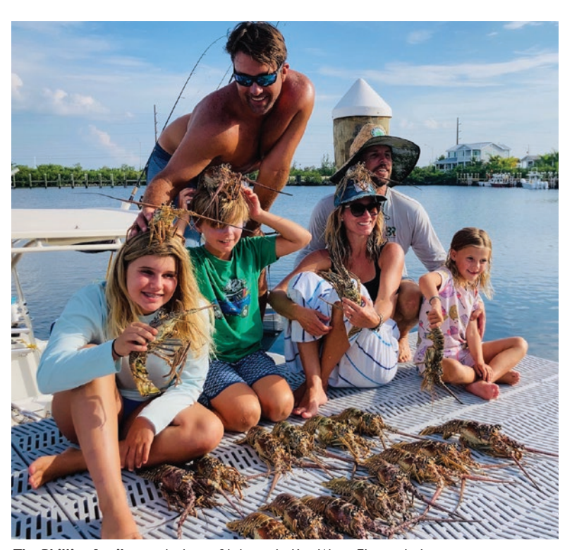
The Phillips family caught lots of lobster in Key West, FL, on their 251 Coastal Explorer!