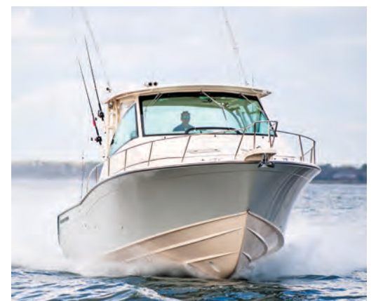
One of Grady-White's most notable changes since the first Anchorline was the introduction of the unparalleled SeaV 2 ® hull, which provides boating's driest and most stable ride.

the existing lineup, and every new model designed since then has been built on the incredible SeaV 2 hull platform. The hull continuously sharpens from the transom to the bow, ranging from under 20 degrees deadrise at the stern to a sea-cutting 30 degrees or so amidships, then reaching a wave-slicing 50-plus degrees at the bow. The deeper vee forward results in a softer ride you won't find on other hulls. This revolutionary design increases the number of comfortable days you can enjoy on the water. With canvas protection and our superior SeaV 2 hull performance, you'll be