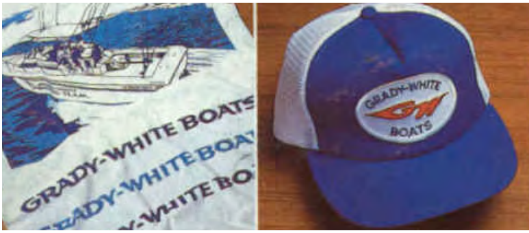
Forty years ago, Grady Gear consisted of a t-shirt, jacket, and hat that you ordered by mailing a form with a check enclosed.