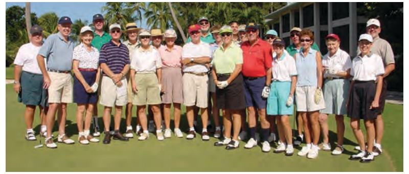
The Vero Beach Grady-White Club, known as the Grady Bunch, was established as the first Grady-White club in 1988. Pictured 2004.

boating in the shoulder seasons – making our boats an even better value today than they were 40 years ago.