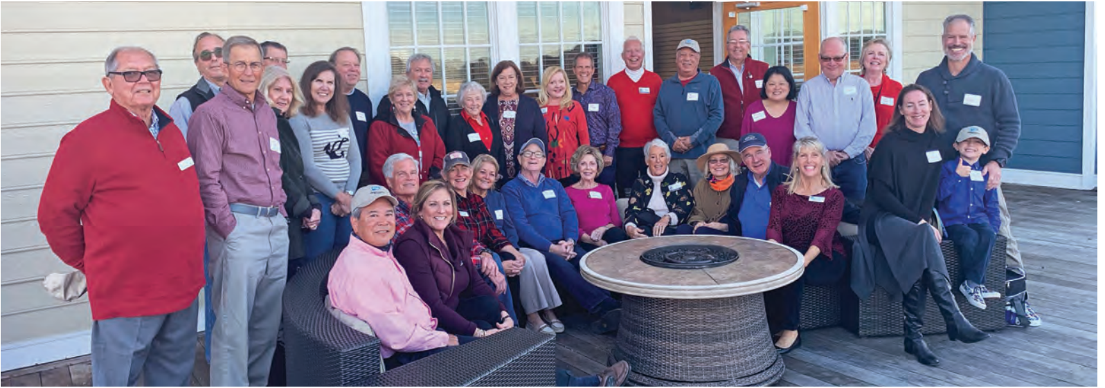
The Tidewater Grady-White Club held its annual holiday party where they unveiled a new website. With 35 members and lots of events and excursions planned, 2022 is going to be a fun year for this club!