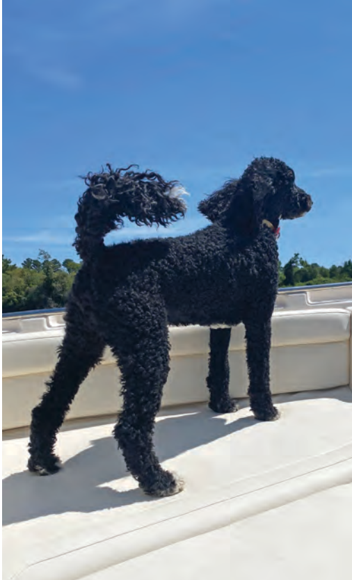
Monty Don , keeps watch on Simon Briggs' new Freedom 325 , Biscuits 'n' Grady .