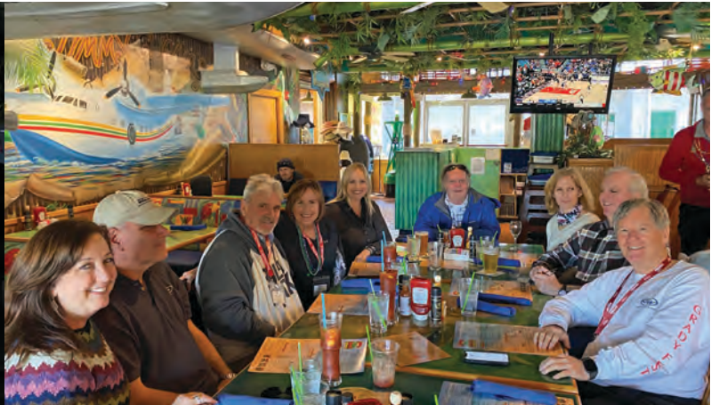
In spite of high winds and cold temperatures, the Tampa Bay Grady-White Club still had fun at their recent brunch event. With winds gusting as high as 46 mph, everyone ended up driving to the restaurant, declaring that “our Gradys can take that kind of punishment, but our captains usually opt not to!” The club is already gearing up for their next event, their 35th Semiannual Kingfish Tournament.