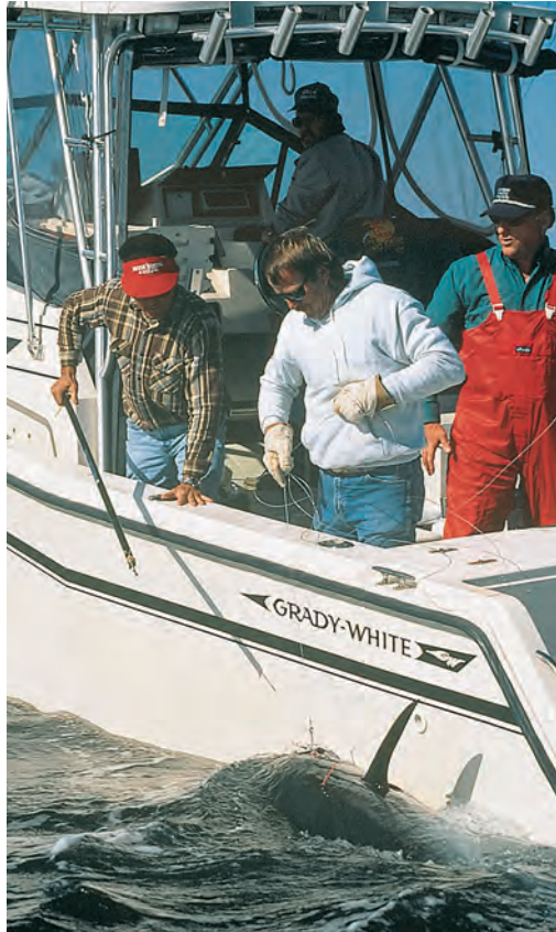
The Spring 1997 issue focused on Grady-White's dedication to conservation and the protection of our fisheries – a commitment that continues today.

In the Spring 1995 edition, Anchorline told our customers we were mailing surveys to each new Grady-White owner and using that information to continuously improve our products. These surveys provided another avenue for our customers to be heard, and as always, we listened! In the Fall of 1996, an Anchorline article stated, "owner research shows that people buy Grady-Whites not only for fishing but also for the pleasure of their kids and grand-kids." Our focus of producing rugged fishing boats evolved from this feedback to incorporate more luxury and convenience