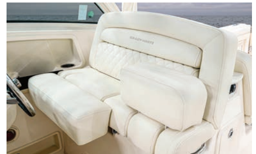
GRADY-WHITE BOATS Greenville, North Carolina; 252-752-2111; gradywhite.com

Above, the all-new AV 2 hardtop is rugged, elegant and functional. With a painted aluminum frame, it houses many amenities, including a full-height windshield, a side enclosure canvas, LED lighting, rod holders, a retractable SureShade cockpit sunshade and more. Underneath, the tempered glass windshield features a windbreak door and an electromechanical