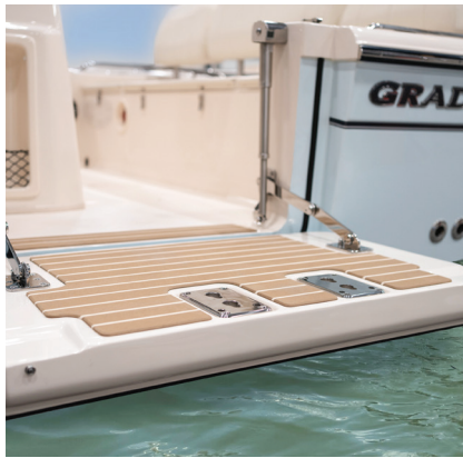
A portside door hinges downward at the touch of a button to haul aboard big fish or serve as a swim platform with a removable boarding ladder.