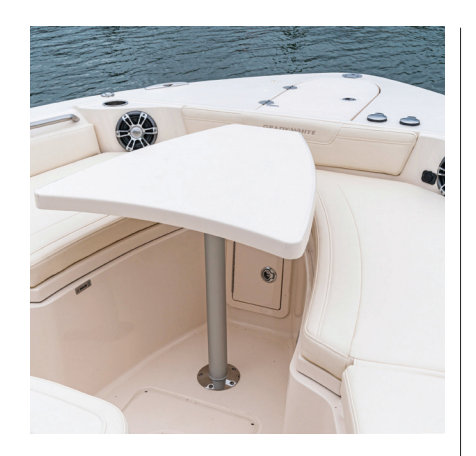
The forward dining table can lower to create an expansive upholstered sun pad. Or remove the cushions and you have a spacious bow casting deck.