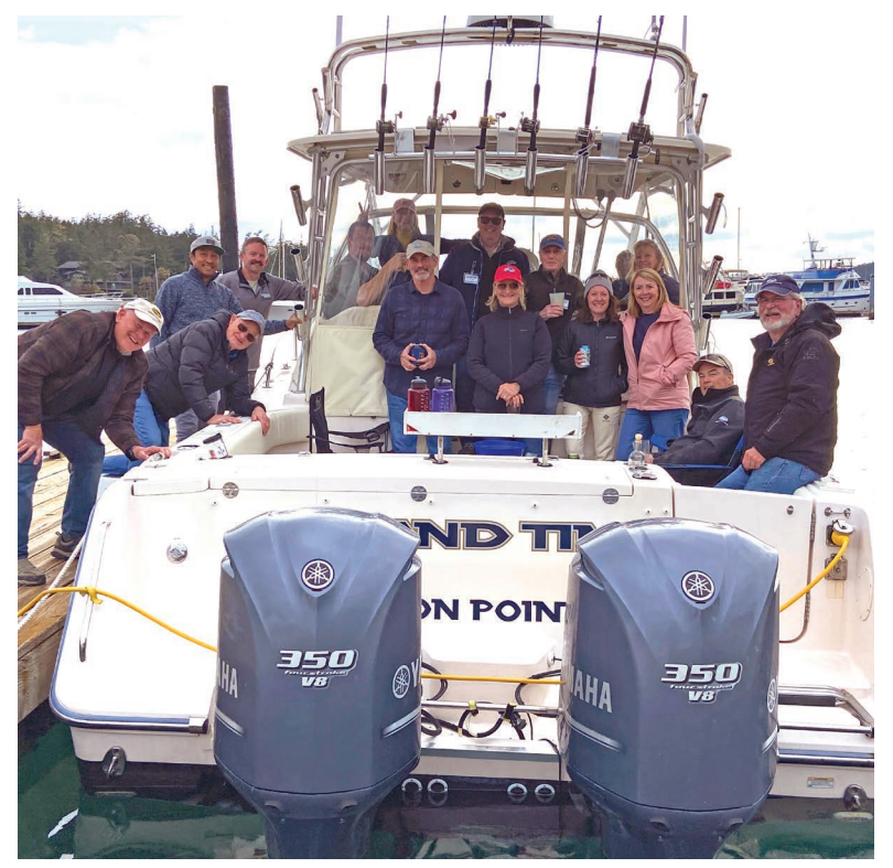
The Northwest Grady-White Club's Spring Lingcod Derby at Roche Harbor was a great success with 24 boats and more than 46 anglers participating and many new members attending. The existing members showed our newest members how to catch lingcod, and it was a fun and friendly competition for everyone involved.

Here are highlights from recent Grady Owners' Clubs events and outings. If you have Grady Club information to share or are interested in clubs in your area, email anchorline@gradywhite.com . Go to gradywhite.com for links to club websites.