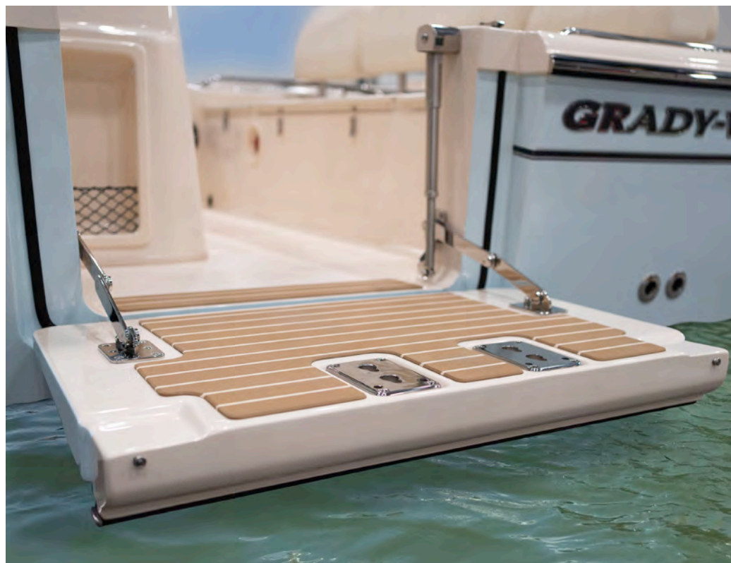
A sturdy, electrically actuated door in the cockpit's port side offers great access for swimmers away from the engines.

For working specific spots along bridge pilings, reefs and wrecks from the Chesapeake Bay Bridge-Tunnel between the Virginia Capes to the Bay Bridge off Annapolis, make sure the bow-mount motor is GPS-enabled to hold the boat in position. The helm offers space for a pair of 16" electronic displays (owner-selected and dealer-installed) that enable the skipper to position the 281 CE precisely for casting and jigging, whether the quarry is drum, cobia, sheepshead or spadefish. Of course, the boat is also perfectly outfitted to anchor over a shell reef for a family panfishing trip seeking croakers, spot and white perch, and rigging it for trolling Spanish mackerel would be easy too. ▶