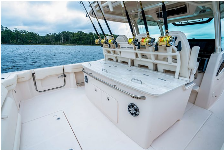
Rod holders and bait station of the helm