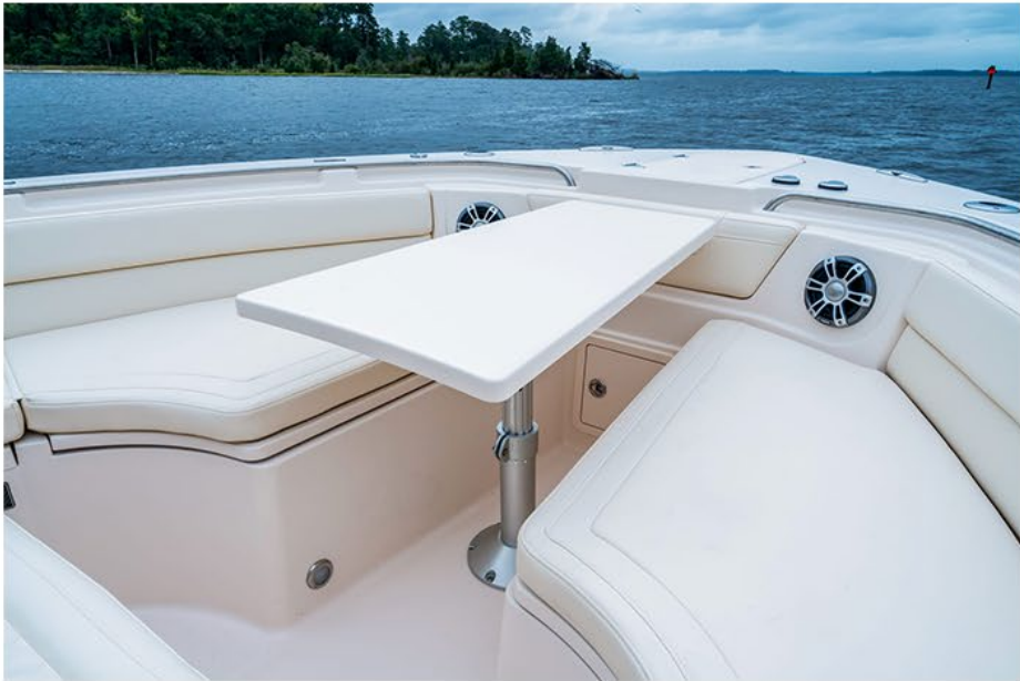
Bow optional table