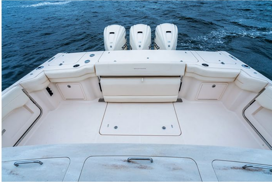
The aft bench