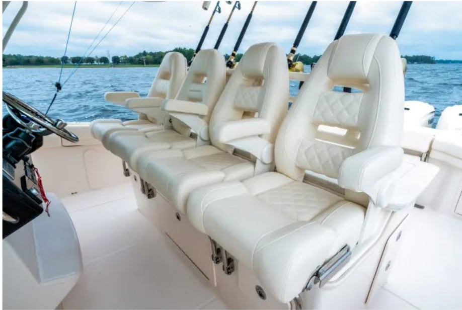
The spacious helm comes standard with four seats. Grady-White Boats

For anglers, the 386 is packed with standard features to make fishing a breeze. A lean bar at the helm comes with six rod holders, knife and plier holders, countertop, bait station, sink, and trash bin. The 386 also features dual 35-gallon livewells, flanked by a 291-quart insulated fish box. The fish box temperature can be controlled through a digital thermostat on the transom. In place of the bait station, owners can opt for an entertainment area with a grill. A foldaway bench adds extra seating.