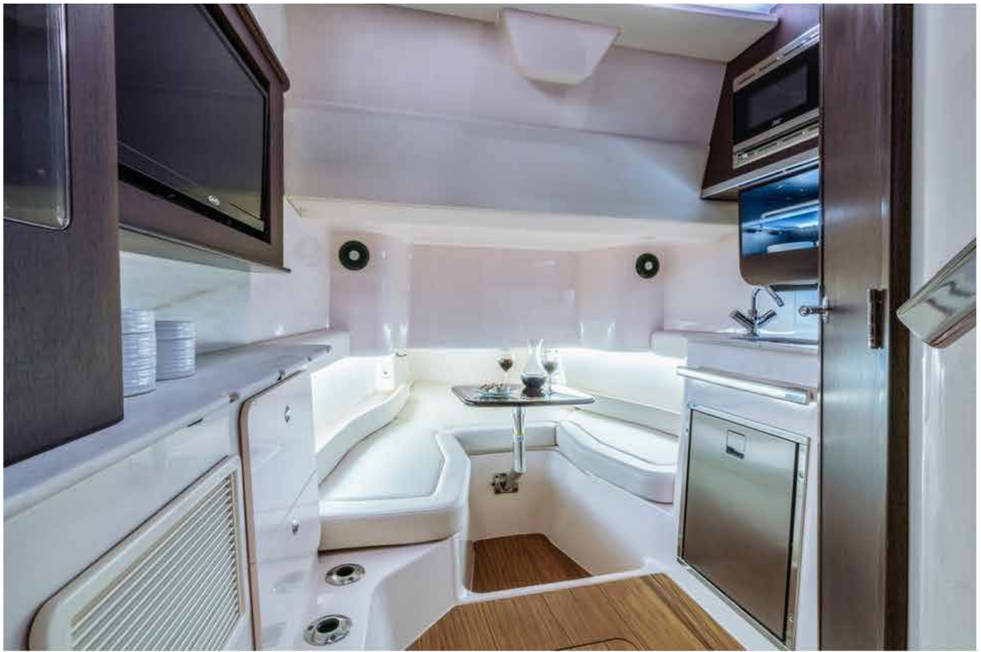
With almost 18-inches of more beam than most other center consoles in her size, and 6-feet, 5-inches of headroom to the skylight, the Canyon 386 provides lots of room for dining and sleeping aboard. The table stows to allow for a large berth.