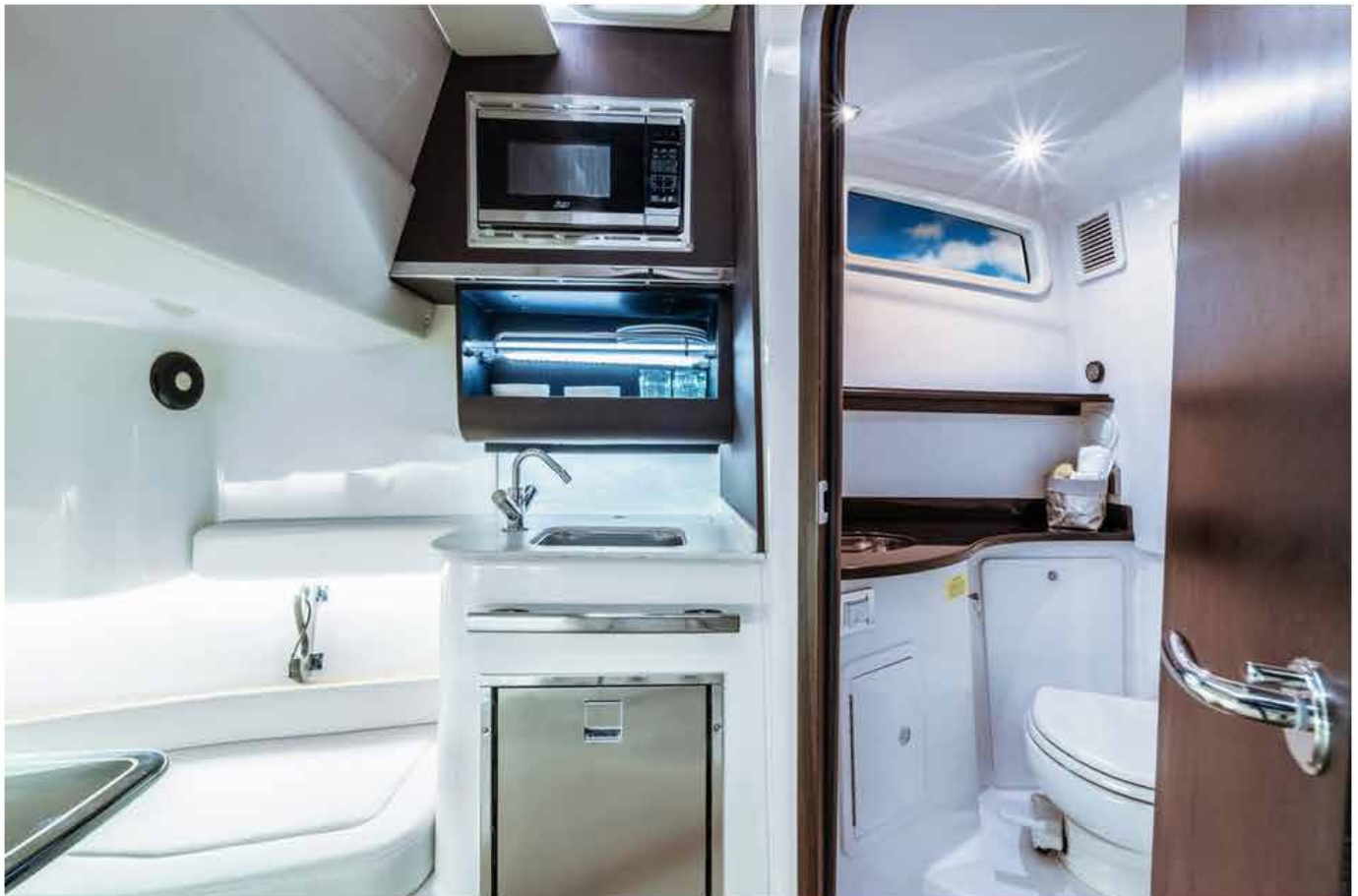
The galley features a microwave, sink, storage space, and a pull out refrigerator. The fully enclosed head is right next door.