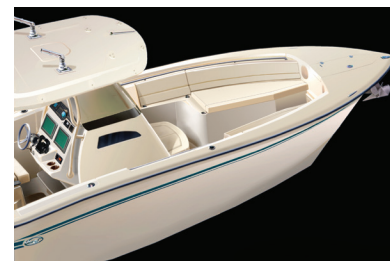
FORWARD SEATING backrest closed

To be introduced at the New York Boat Show in January, an optional Canyon 271 FS model will increase the versatility of days out with the family with the addition of port and starboard forward seating, each with an 85-quart insulated self-draining box beneath to serve as cooler/fish box or dry storage. This seating features all new integrated seatbacks that fold seamlessly into the bolster area to open the bow for fishing action, and these seatbacks are adjustable for more comfort. Forward console seating is retained, with a built-in 67-quart cooler beneath. This enhanced layout increases bow seating capacity from the simple two-person seat to now seating five or more people. The 271 FS anchor locker is redesigned with a horizontal windlass, increasing forward deck space.