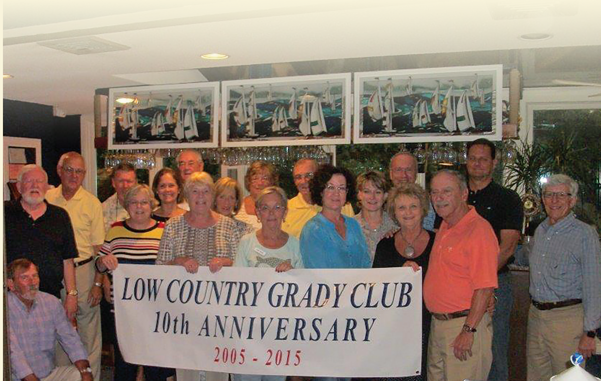
CONGRATULATIONS TO THE LOW COUNTRY GRADY-WHITE CLUB that celebrated their tenth anniversary at the Hilton Head Yacht Club.

The Low Country Grady-White Club celebrated its tenth anniversary with a catered dinner on October 3 at the Hilton Head Yacht Club. A slide show of more than 800 club photographs ran