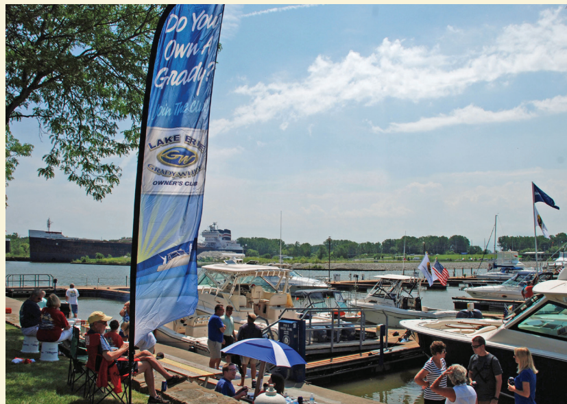
THE BANNERS WERE FLYING on a beautiful July day at Huron Boat Basin for the Lake Erie Grady-White Club Extravaganza.

gazing. Daytime on Friday and Saturday was spent in and around the pool or on leisurely strolls. Friday evening, five boats cruised up the Choptank River to the Suicide Bridge restaurant, joined by more participants by land. Saturday evening's highlight was a super docktail party, and there was an impromptu cornhole tournament. Calm seas on Sunday morning allowed an easy cruise for all heading out north, south or west to their