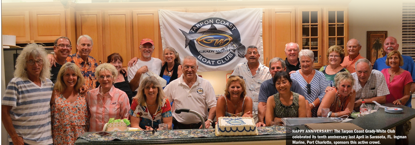
HAPPY ANNIVERSARY! The Tarpon Coast Grady-White Club celebrated its tenth anniversary last April in Sarasota, FL. Ingman Marine, Port Charlotte, sponsors this active crowd.