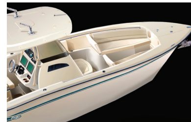
FORWARD SEATING backrest open