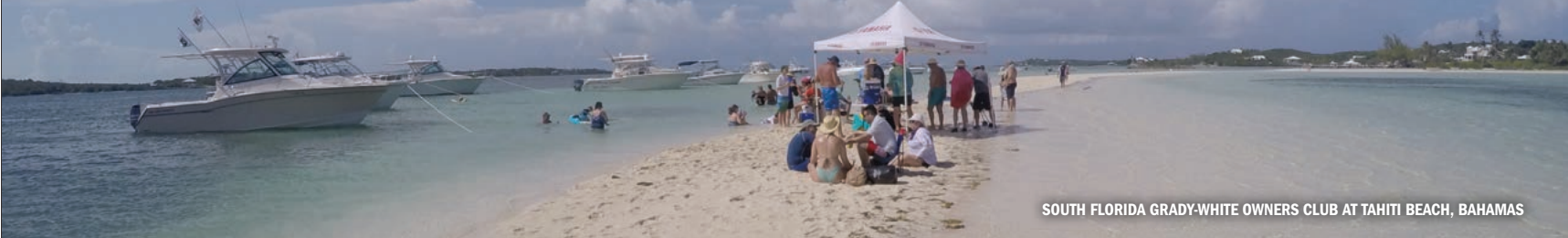
SOUTH FLORIDA GRADY-WHITE OWNERS CLUB AT TAHITI BEACH, BAHAMAS