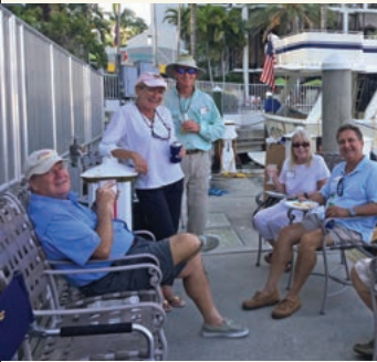
TAMPA BAY AND TARPON COAST CLUBS Sarasota docktails