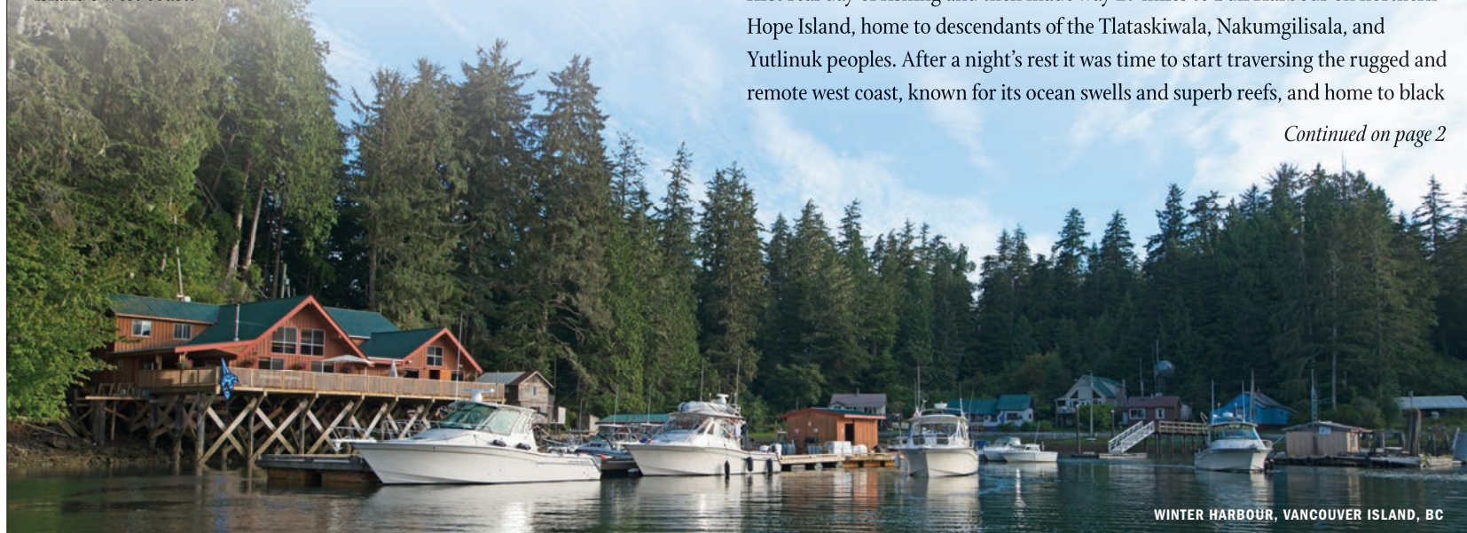
WINTER HARBOUR, VANCOUVER ISLAND, BC