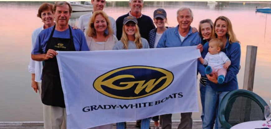
THE SWAN'S ISLAND, MAINE, GRADY-WHITE CREW is composed of three extended families that have summered on this island for many years. Everyone shown here is a relative, the youngest being nine months and sporting her Grady Baby togs.