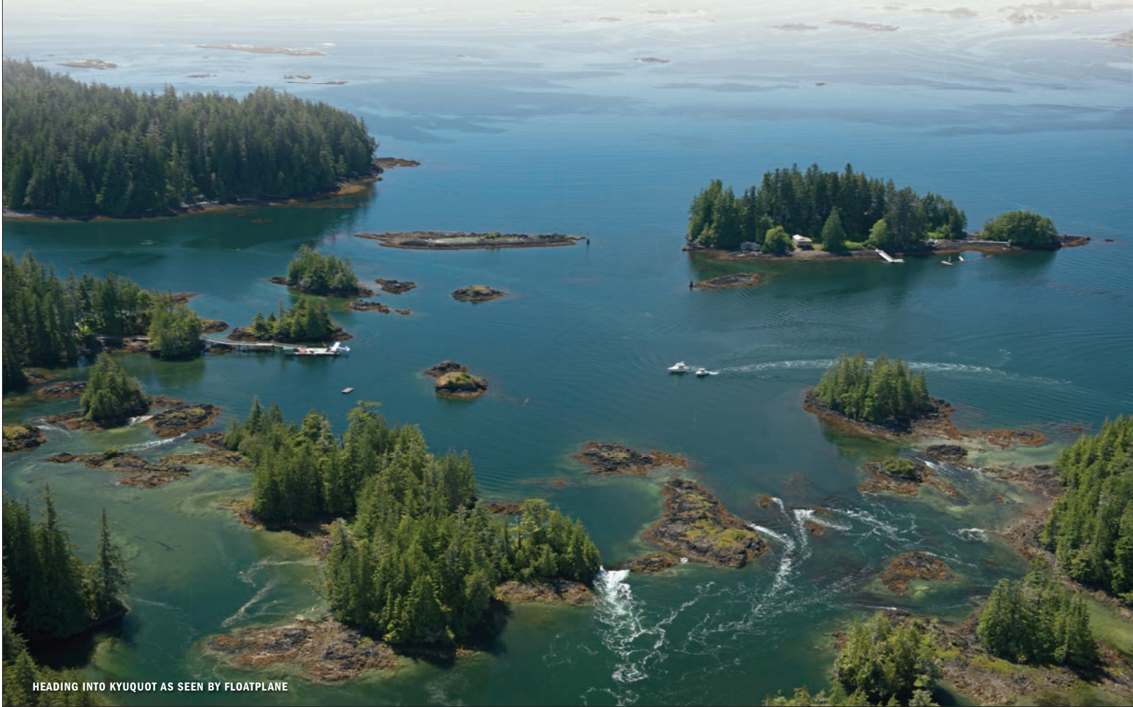
HEADING INTO KYUQUOT AS SEEN BY FLOATPLANE