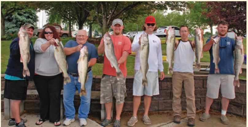
MEMBERS OF TEAMS SSM AND JW placed first and second respectively in the 2016 Lake Erie Grady-White Club Walleye Tournament.