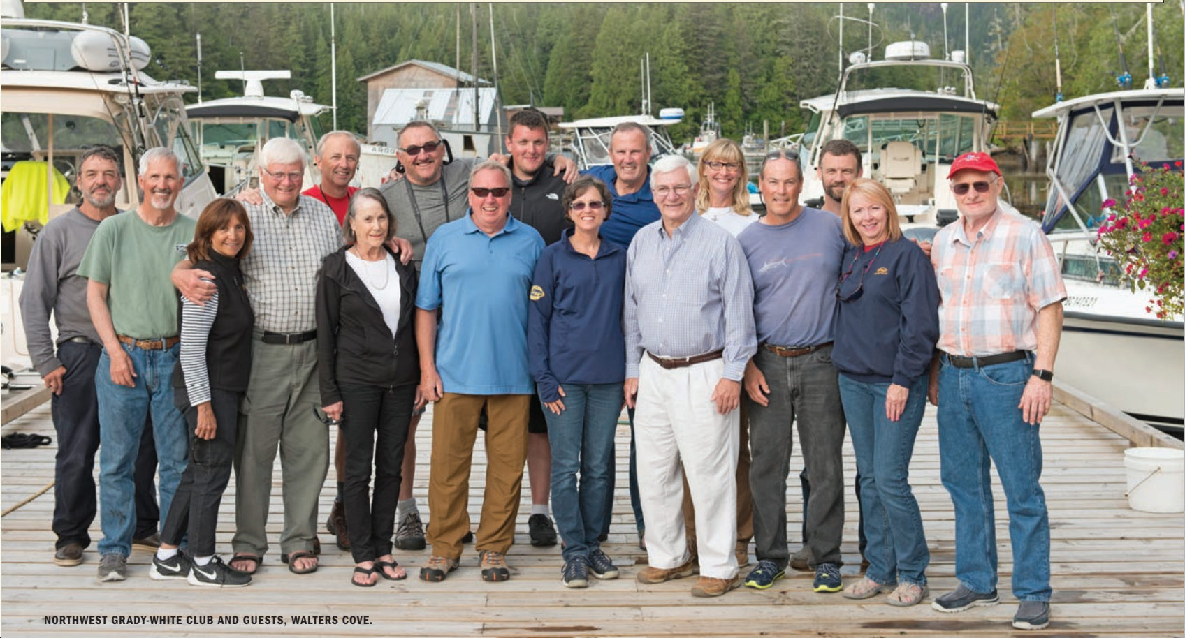
NORTHWEST GRADY-WHITE CLUB AND GUESTS, WALTERS COVE.