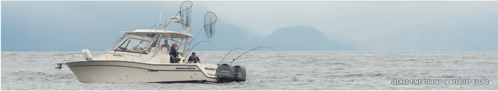
ISLAND TIME FISHING IN KYUQUOT SOUND