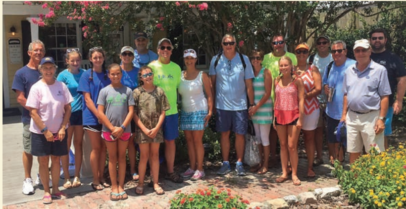
CAPE FEAR GRADY CLUB members and guests enjoyed a combination navigation refresher course and lunch cruise to downtown Wilmington, NC, enjoying the Pilot House restaurant compliments of sponsor Atlantic Marine.

Here are highlights from recent Grady Owners' Clubs events and outings. If you have Grady club information to share or are interested in information about Grady clubs in your area, email anchorline@gradywhite.com . Go to www.gradywhite.com for links to club websites.