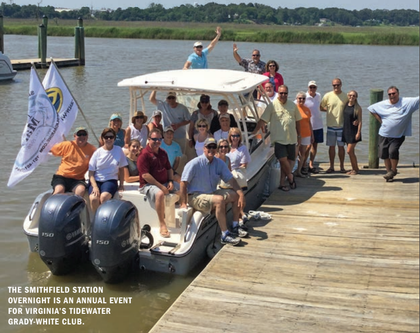
THE SMITHFIELD STATION OVERNIGHT IS AN ANNUAL EVENT FOR VIRGINIA'S TIDEWATER GRADY-WHITE CLUB.